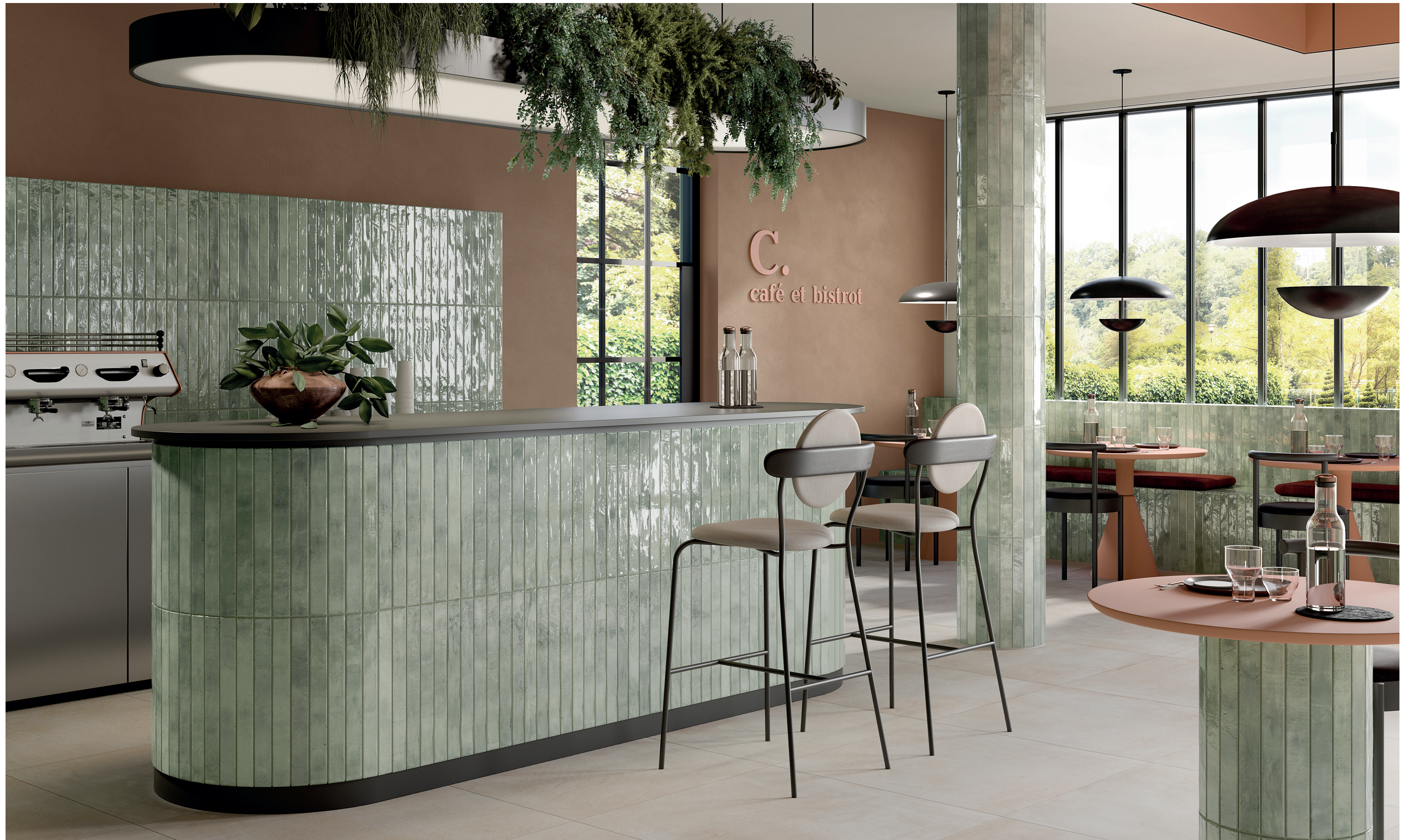
2" x 18" Field Tile in Aquamarine