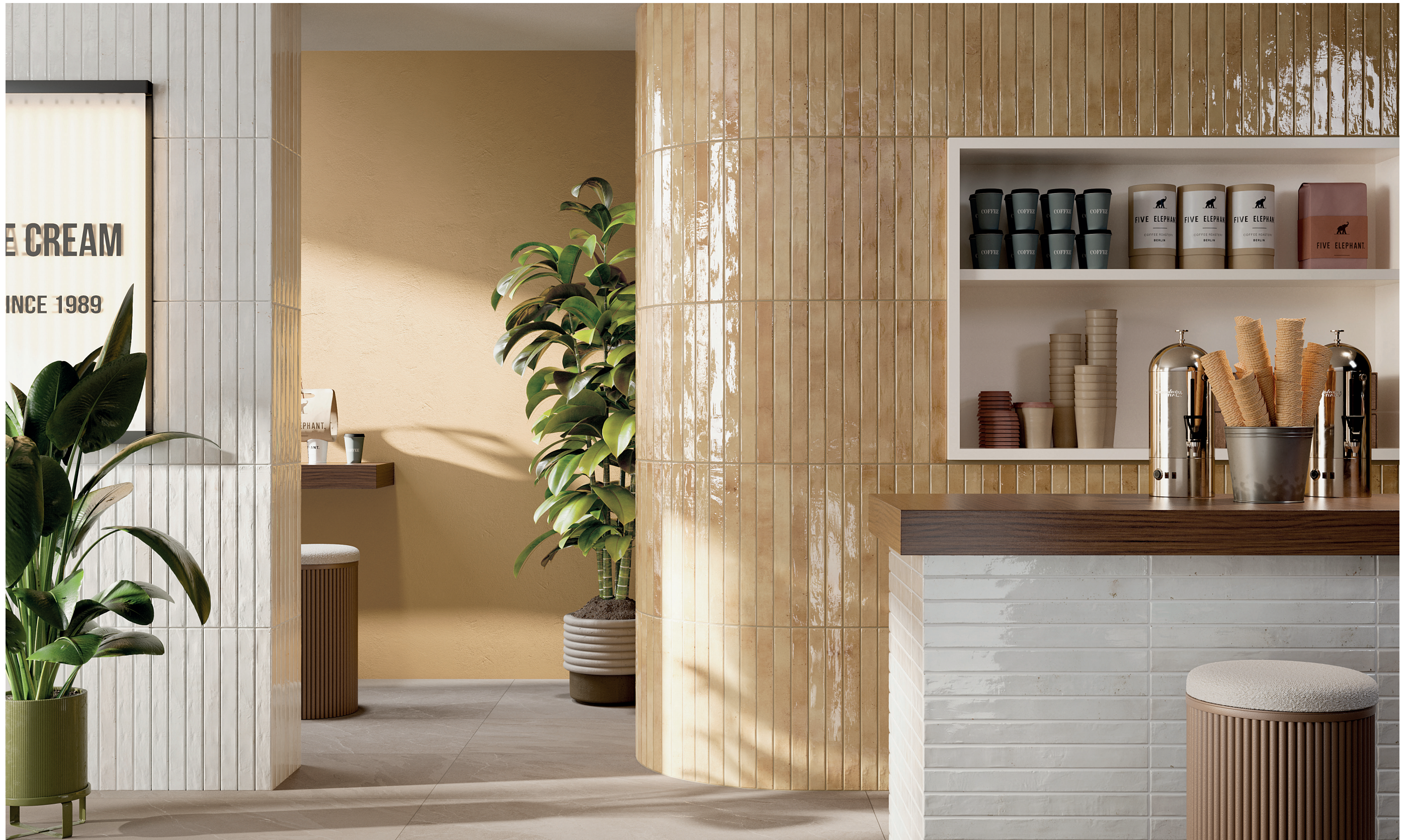
2" x 18" Field Tile in White and Beige