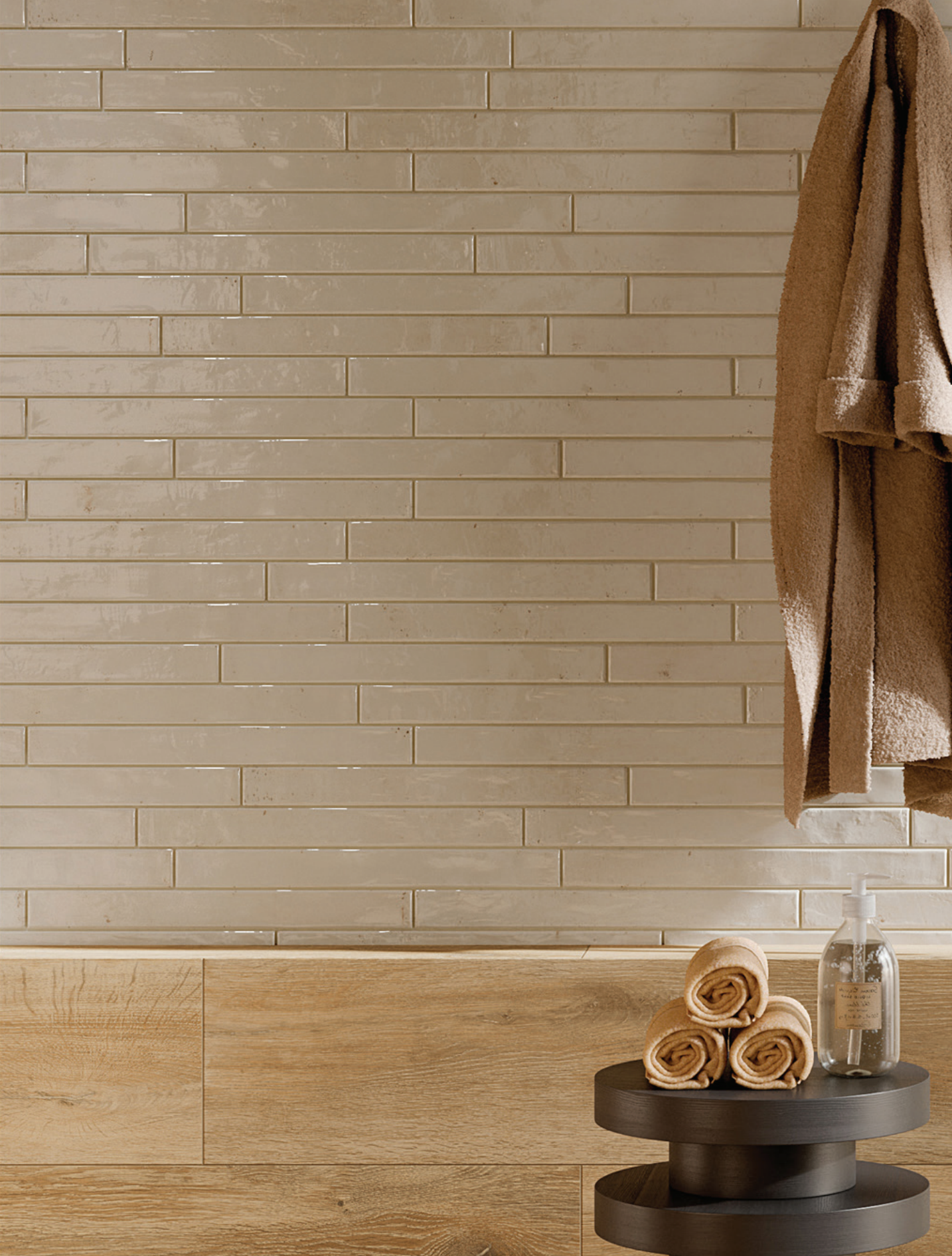
2"x 18" Field Tile in Ivory