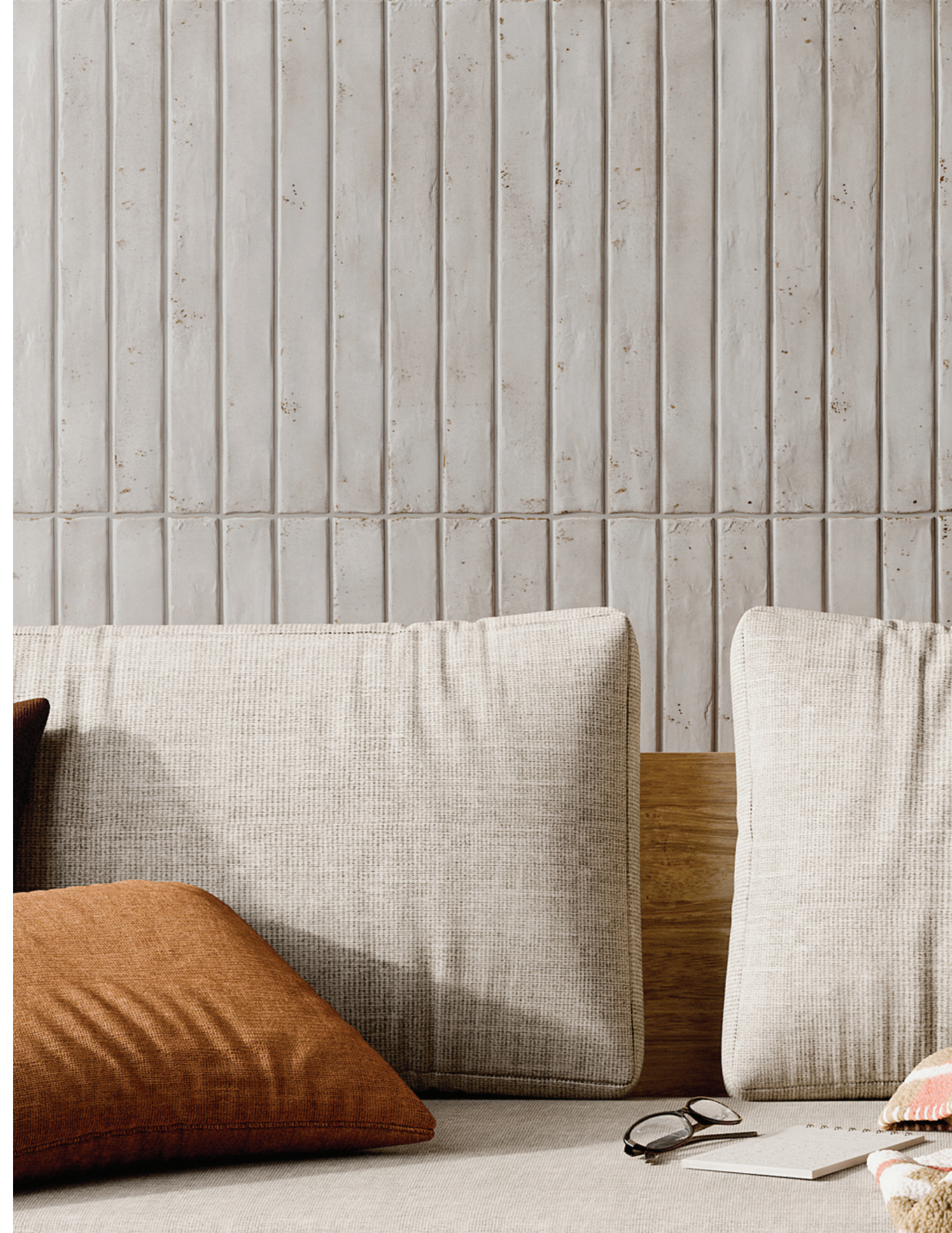
2"x 18" Field Tile in Light Grey