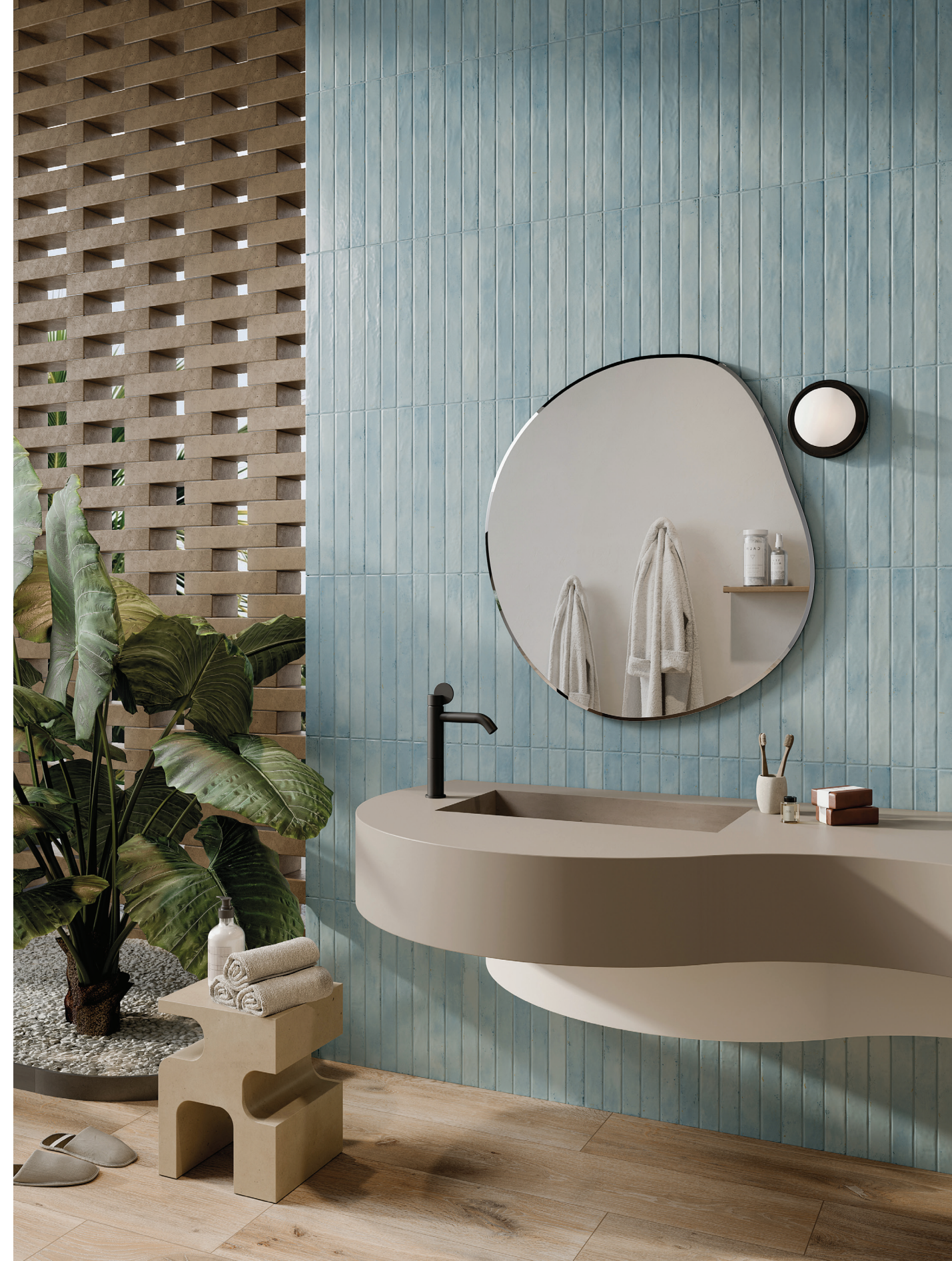
2" x 18" Field Tile in Sky