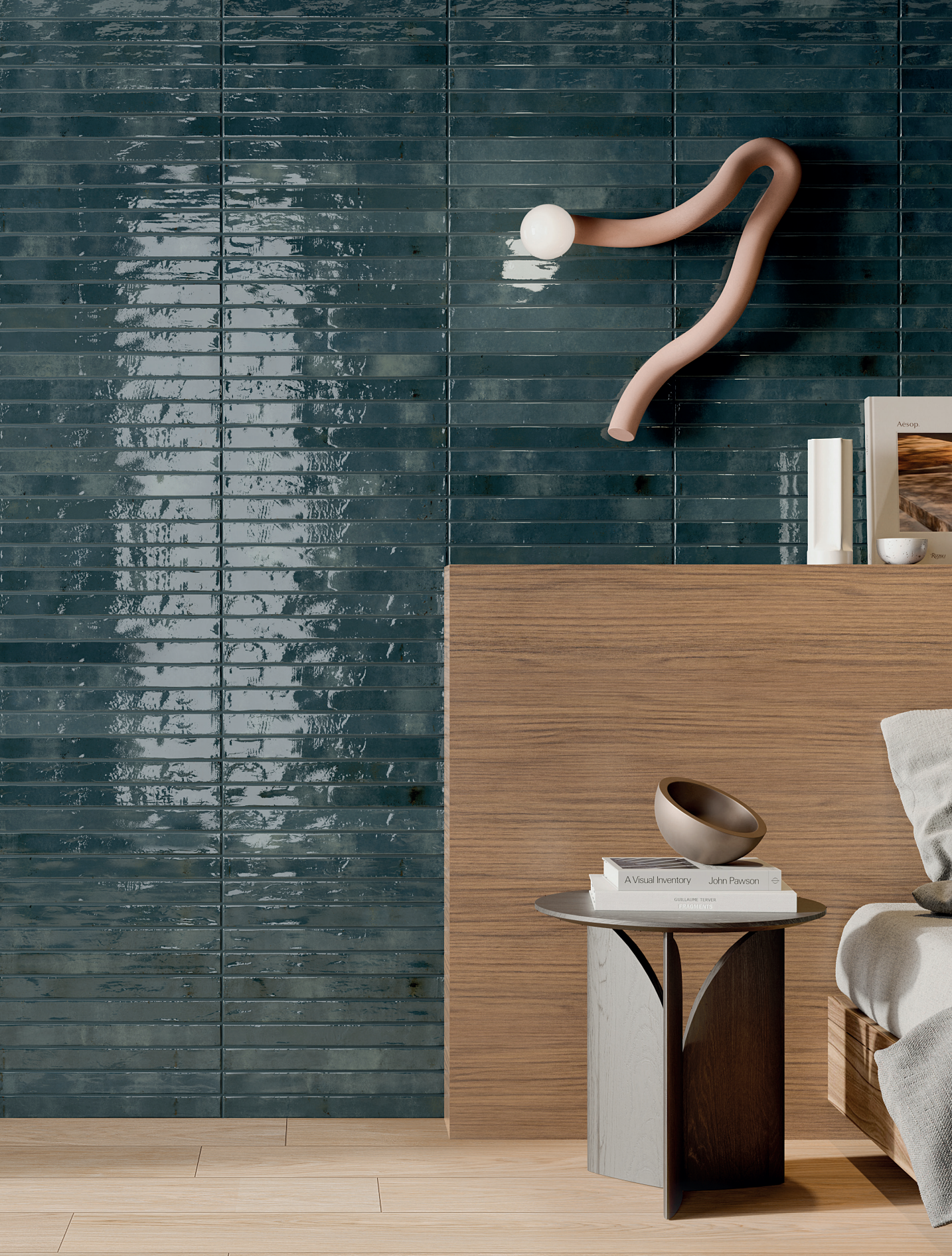
2" x 18" Field Tile in Blue