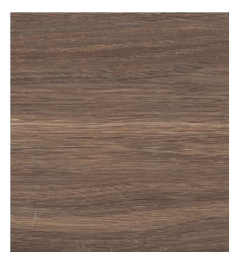
Naturel Beige Brun