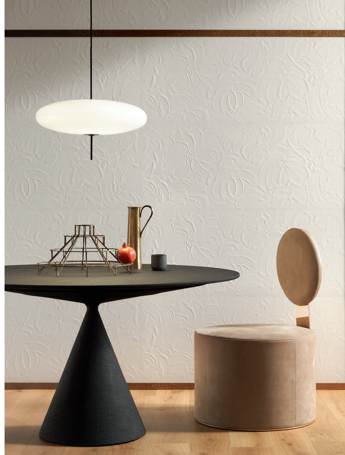
19.625" x 47.25" Bloom Wall Deco in White