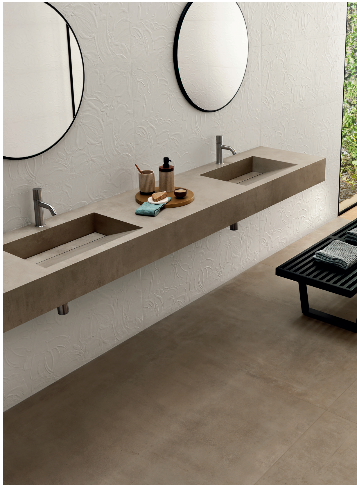
19.625" x 47.25" Bloom Wall Deco in White