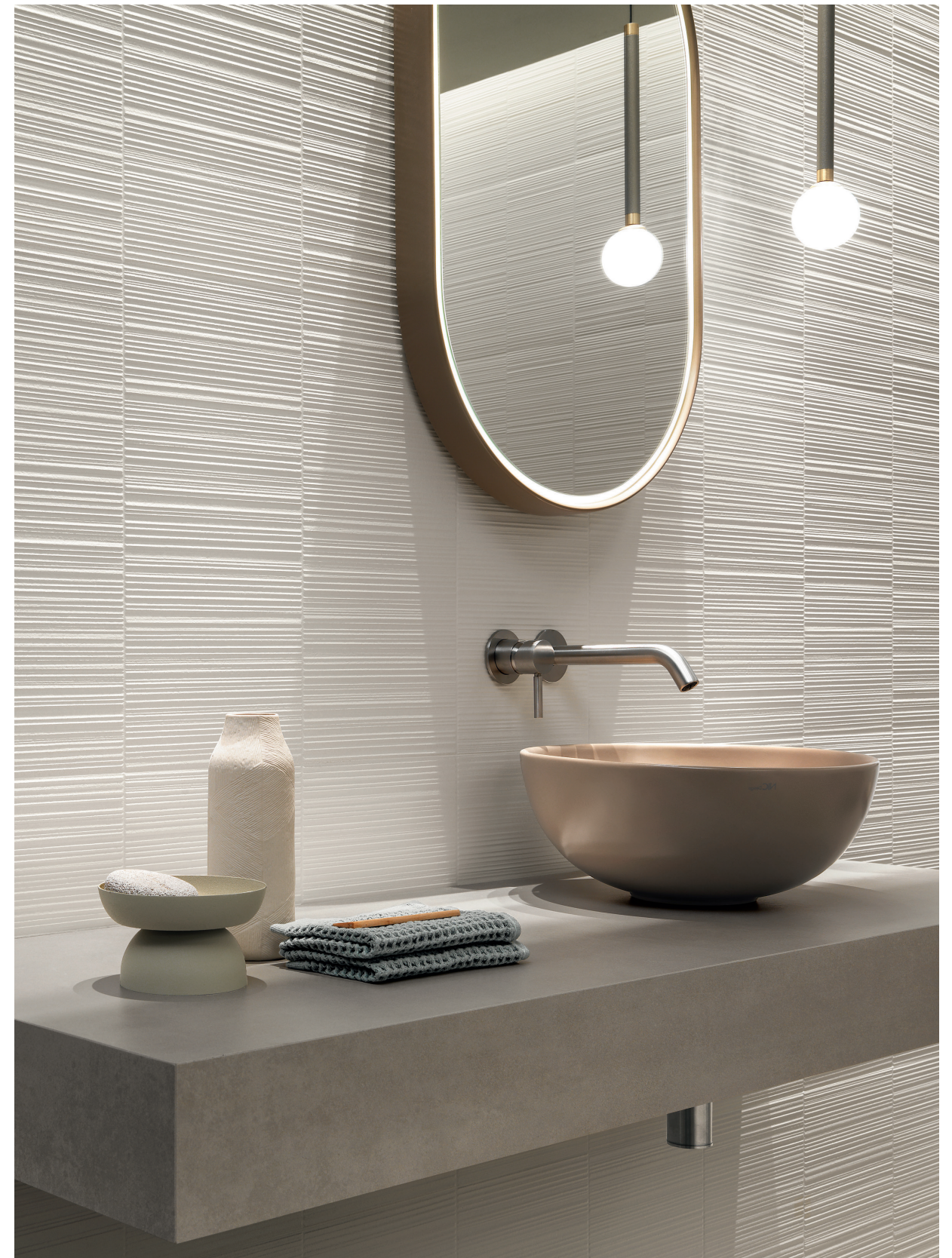
19.625" x 47.25" Barcode Wall Deco in White