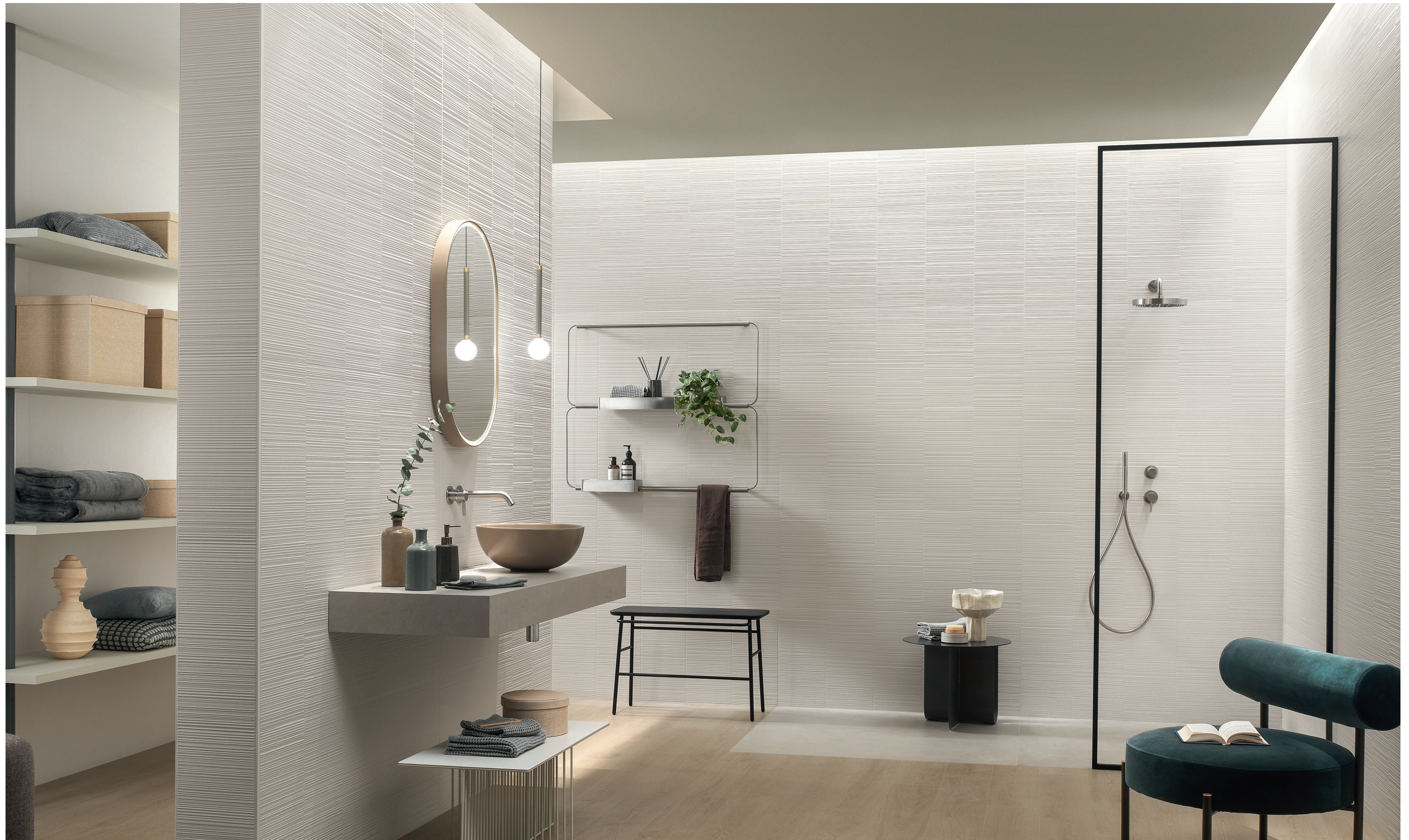
19.625" x 47.25" Barcode Wall Deco in White