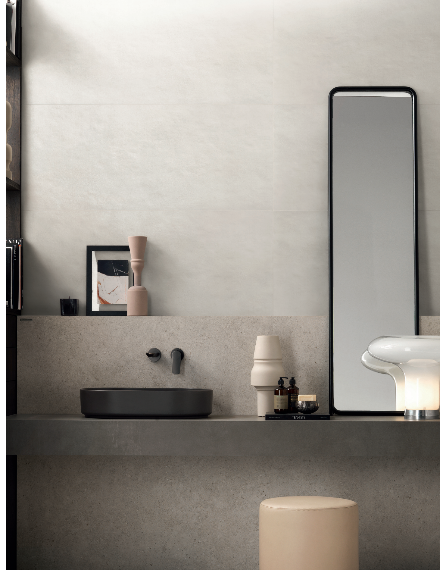
19.625" x 47.25" Wall Tile in White