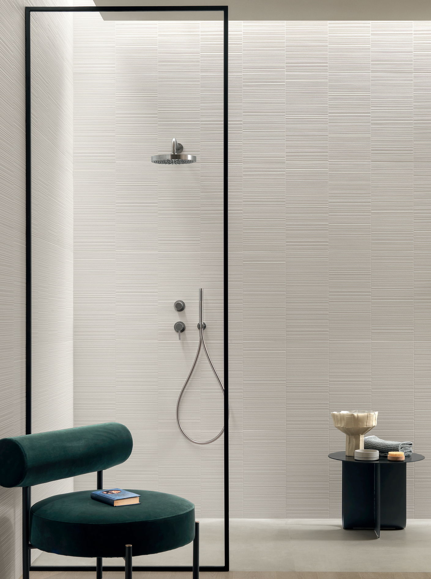
19.625" x 47.25" Barcode Wall Deco in White