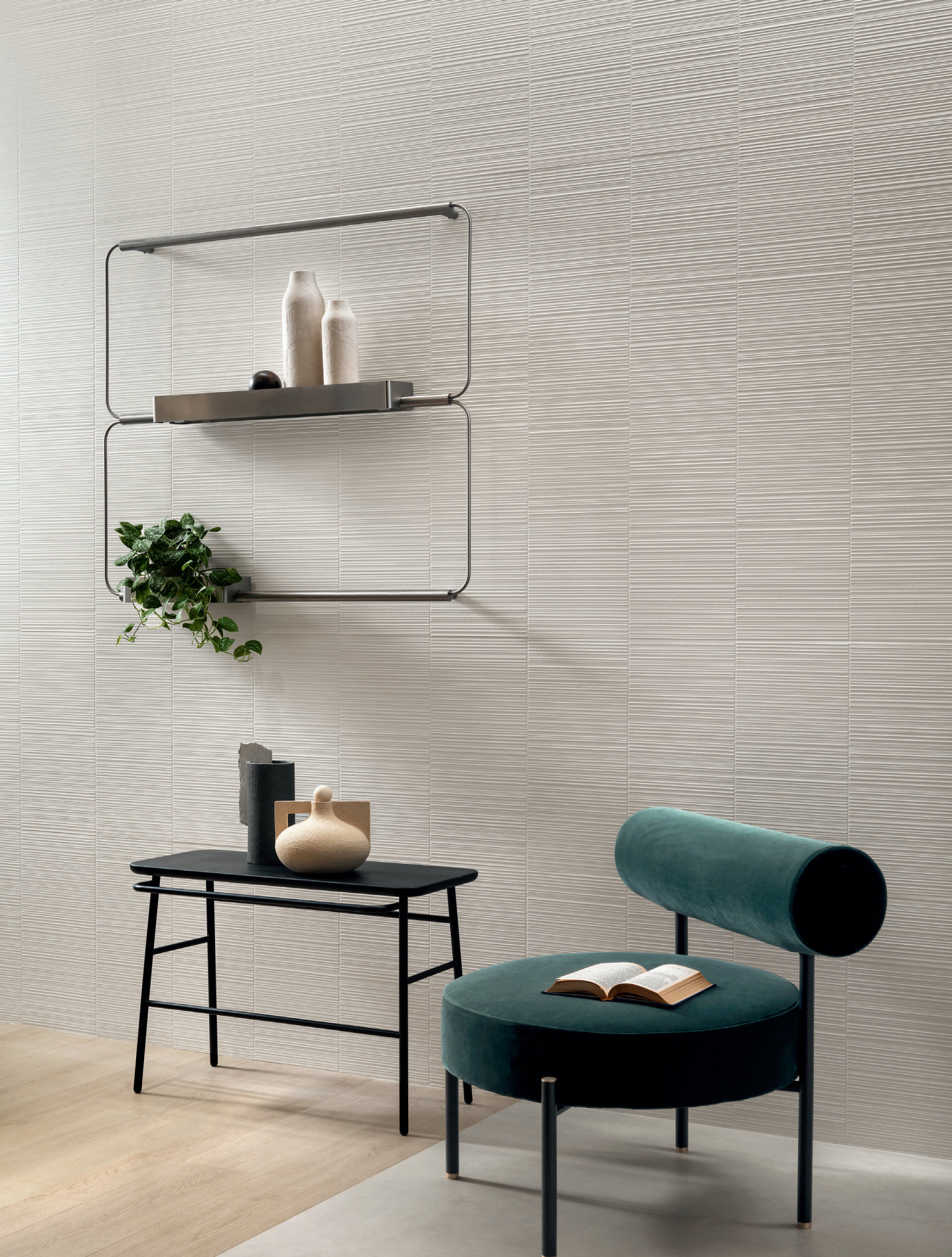
19.625" x 47.25" Barcode Wall Deco in White