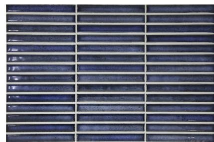
Grout Between Finger Grooves

Colors shown may vary from actual product. Final selection should be made from actual product samples. Products and availability are subject to change, please refer to our website for the most up to date selection.