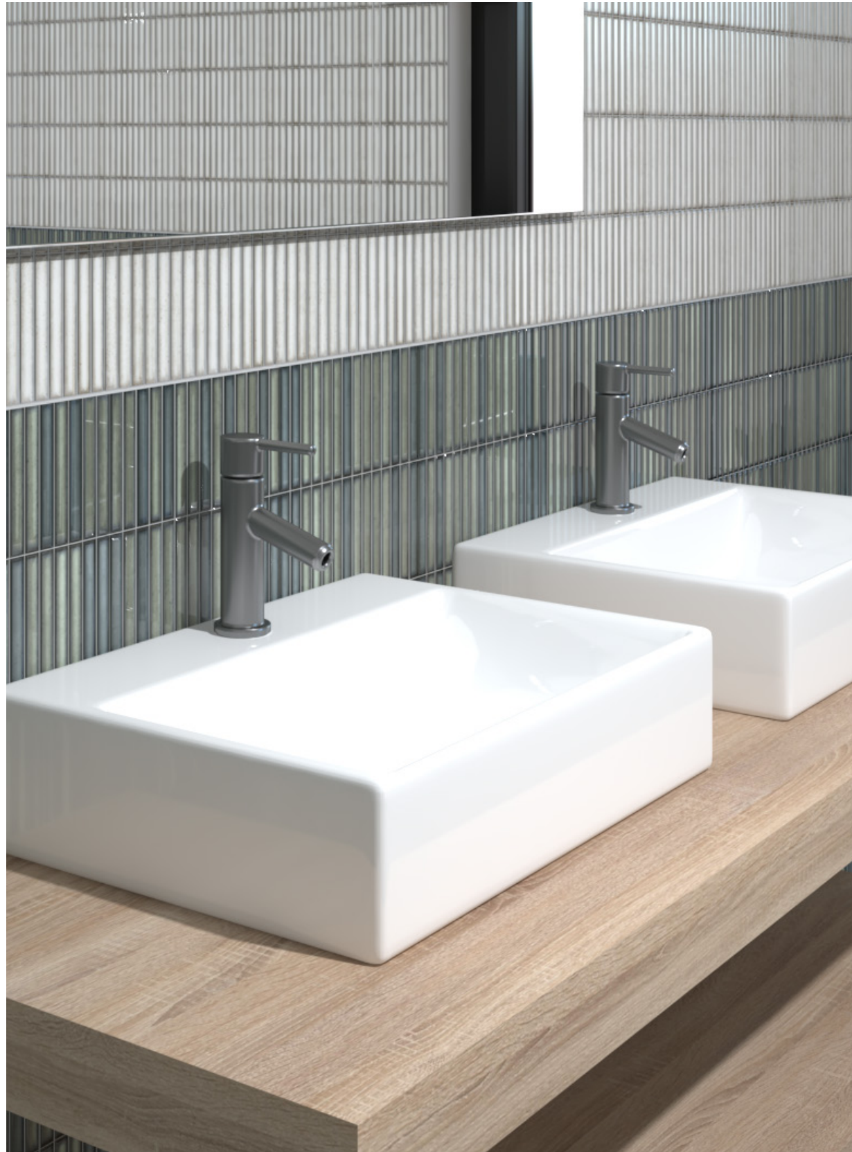
4.5" x 9" Wall Deco in Chalky 4.5" x 9" Wall Deco in Wear