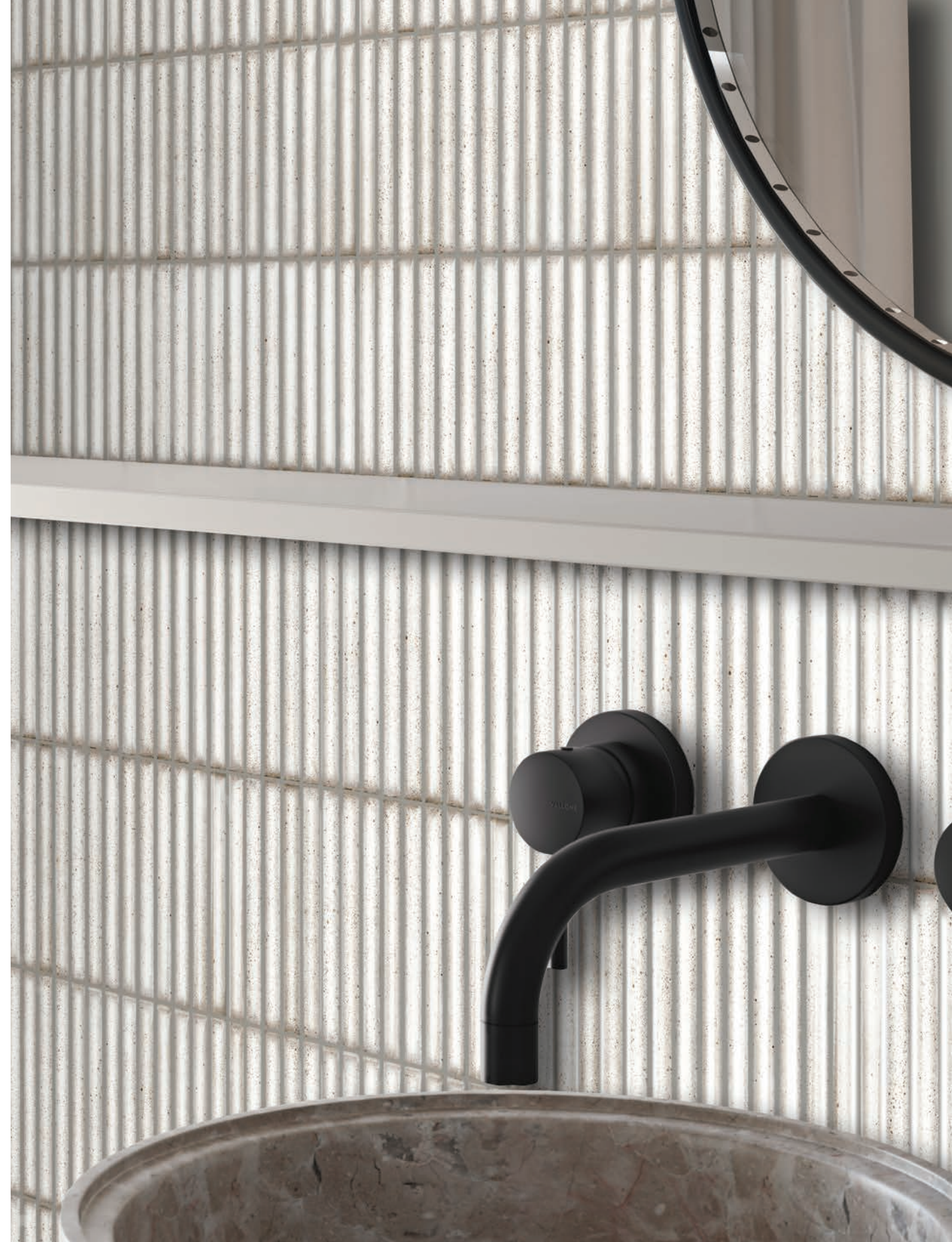
4.5" x 9" Wall Deco in Chalky