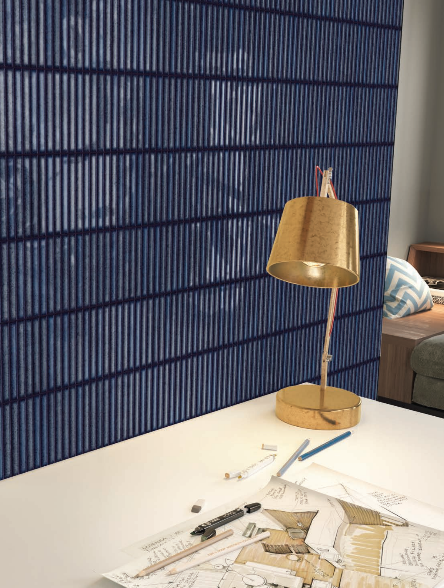
4.5" x 9" Wall Deco in Midnight