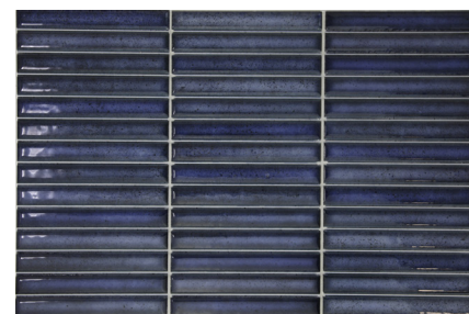
Grout Between Tile