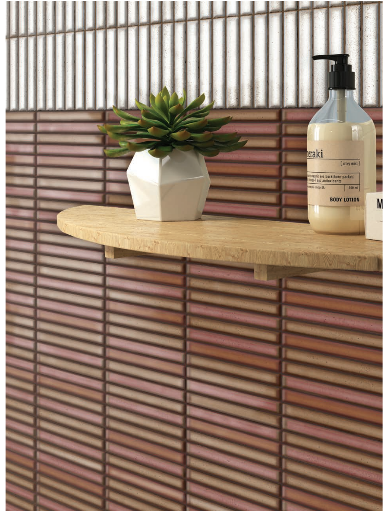
4.5" x 9" Wall Deco in Chalky 4.5" x 9" Wall Deco in Rusty Red