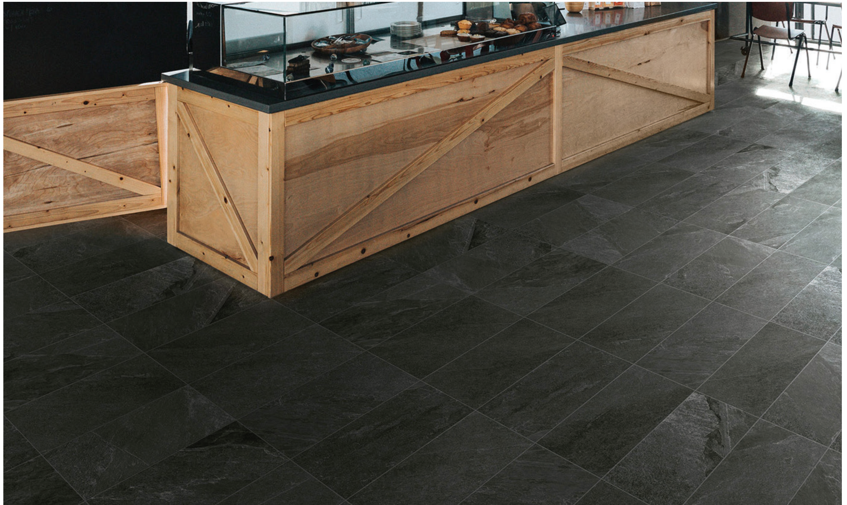
12" x 24" Field Tile in Nightfall Black