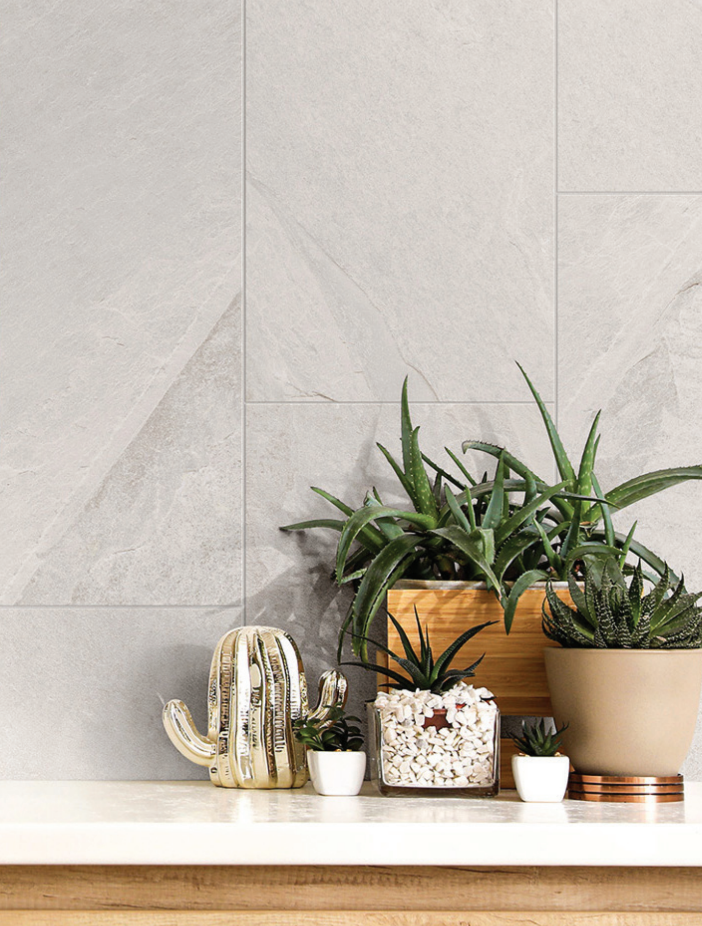
12" x 24" Field Tile in Stardust White