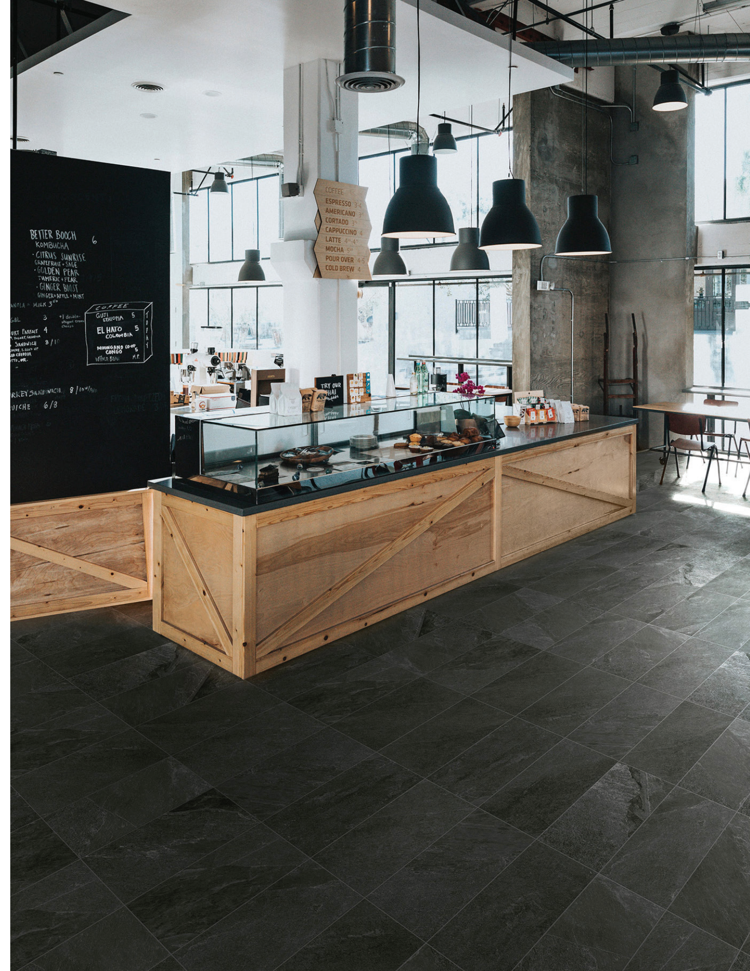
12" x 24" Field Tile in Nightfall Black