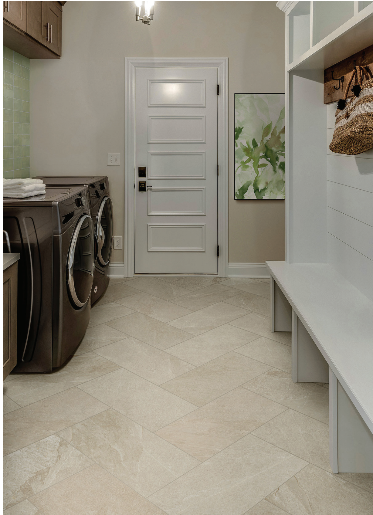
12" x 24" Field Tile in Pinnacle Beige