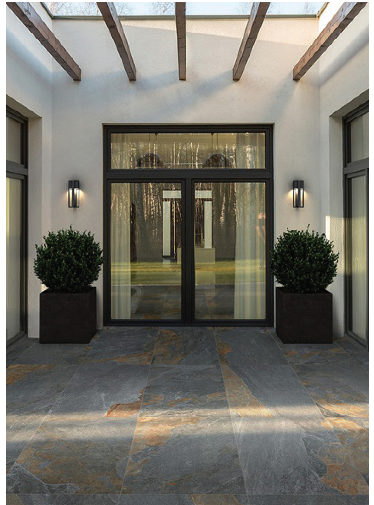
24" x 36" Paver in Canyon Slate