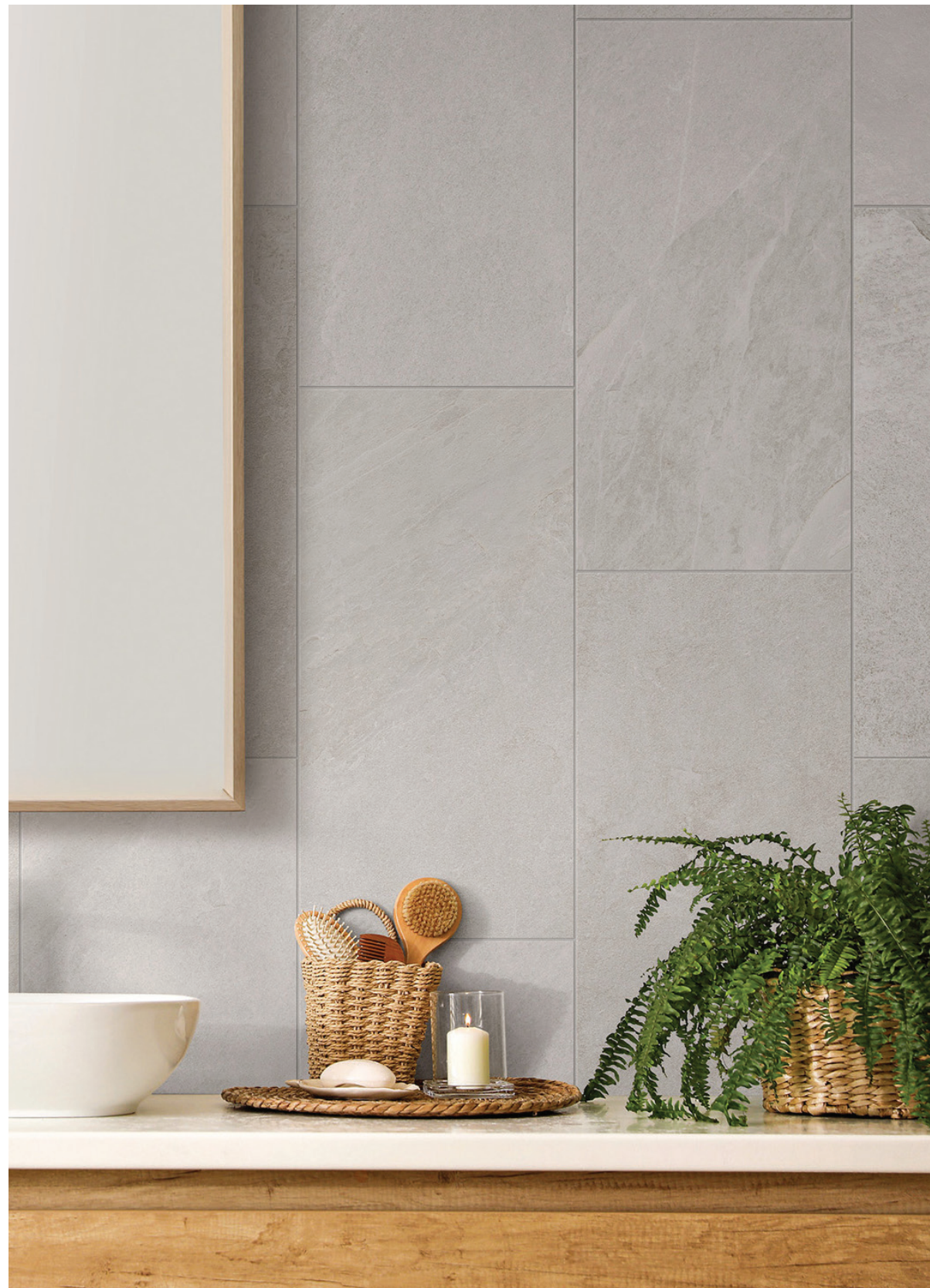
12" x 24" Floor/ Wall Tile in Stardust White