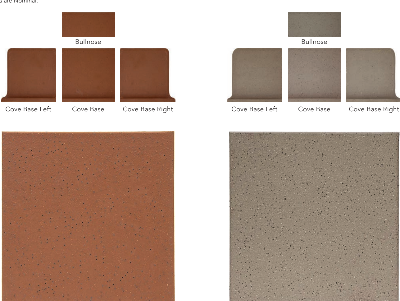
#31IS Mayflower Red