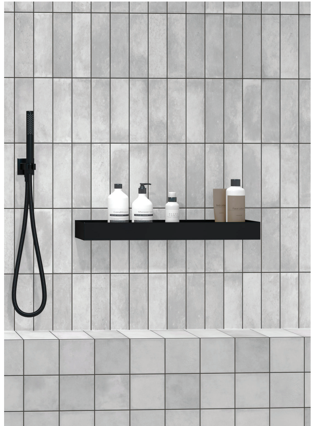
2.5" x 9" Floor/Wall Tile in White 4.5" x 4.5" Floor/Wall in White