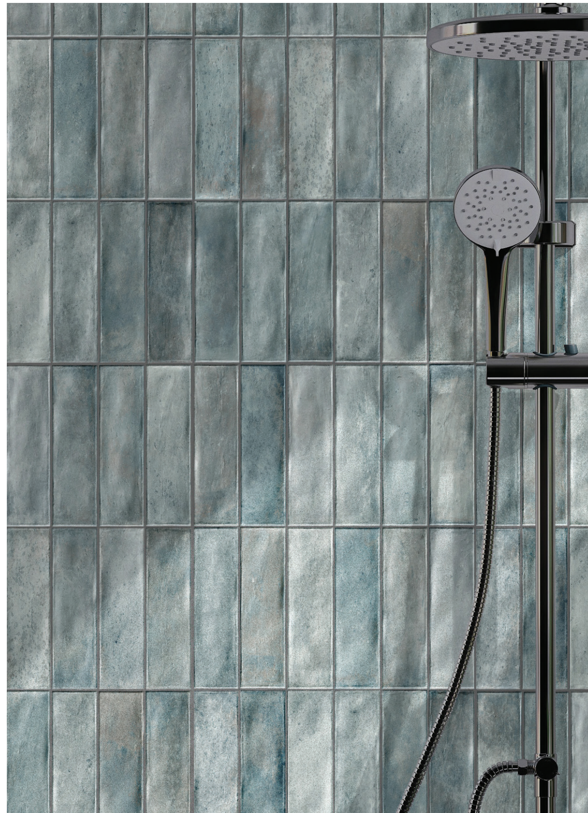
2.5" x 9" Floor/Wall Tile in Blue