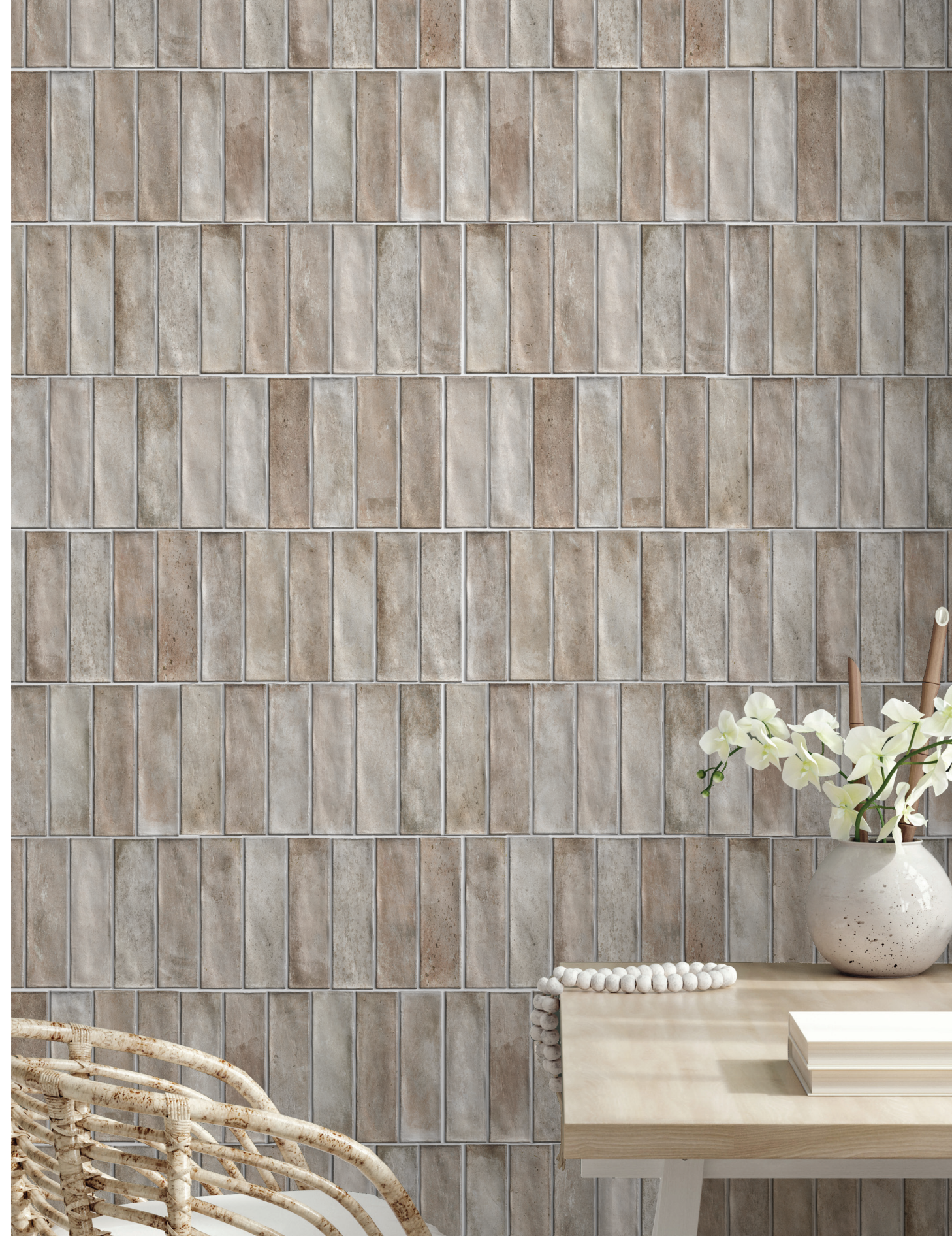
2.5" x 9" Floor/Wall Tile in Cream