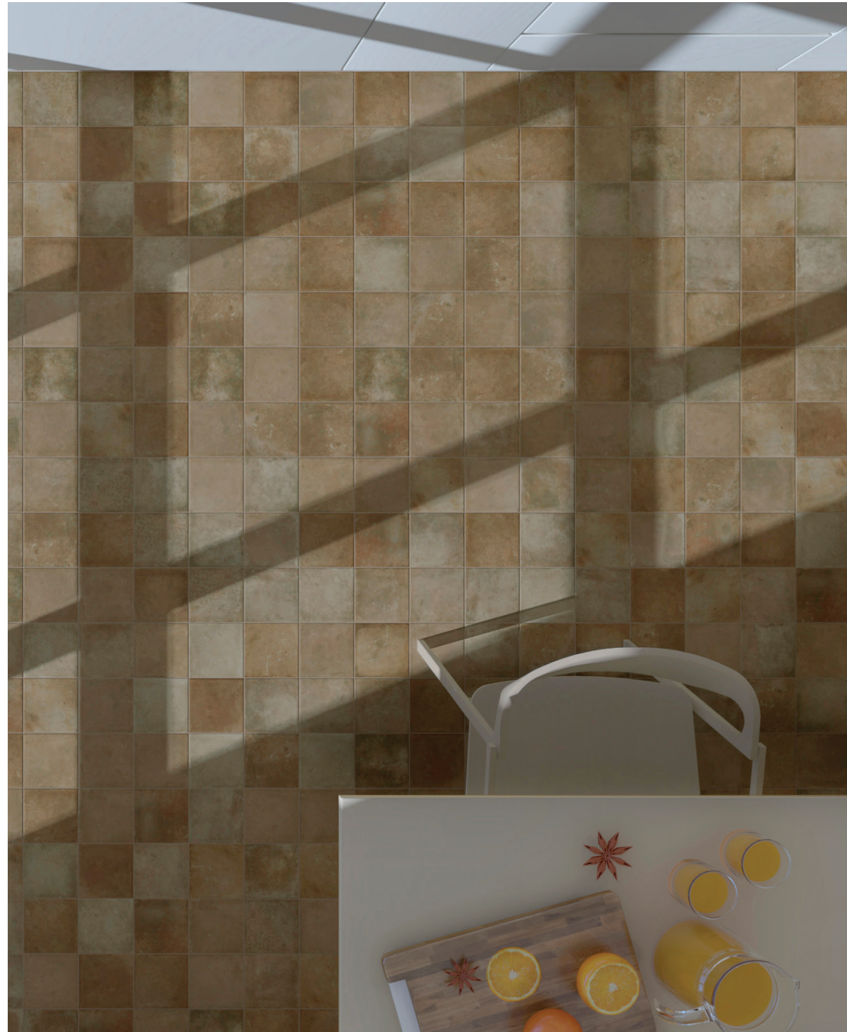
4.5" x 4.5" Floor/Wall Tile Terracotta