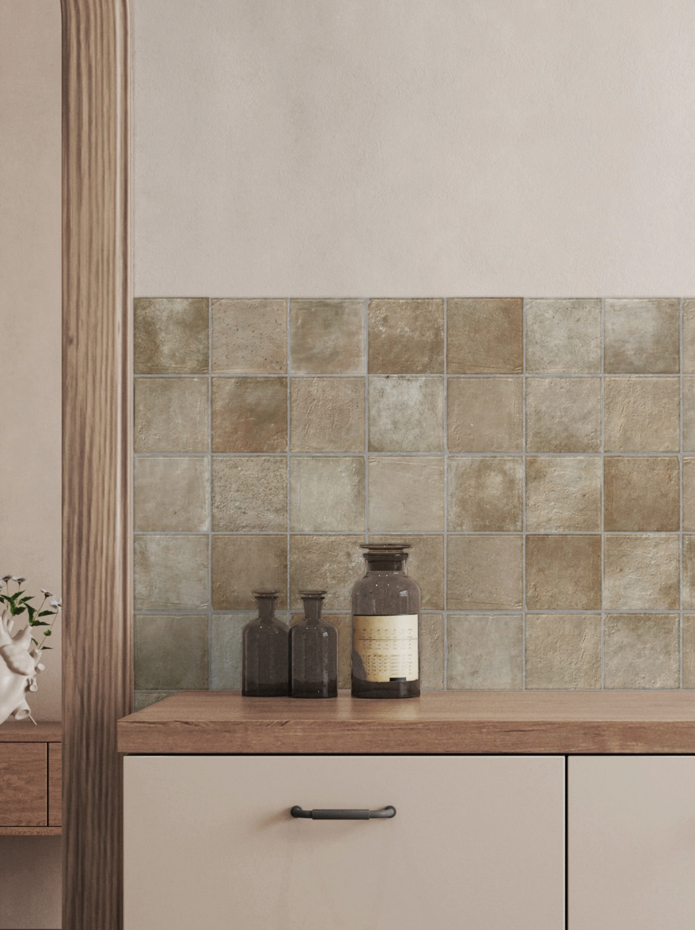
4.5" x 4.5" Floor/Wall Tile in Sabbia