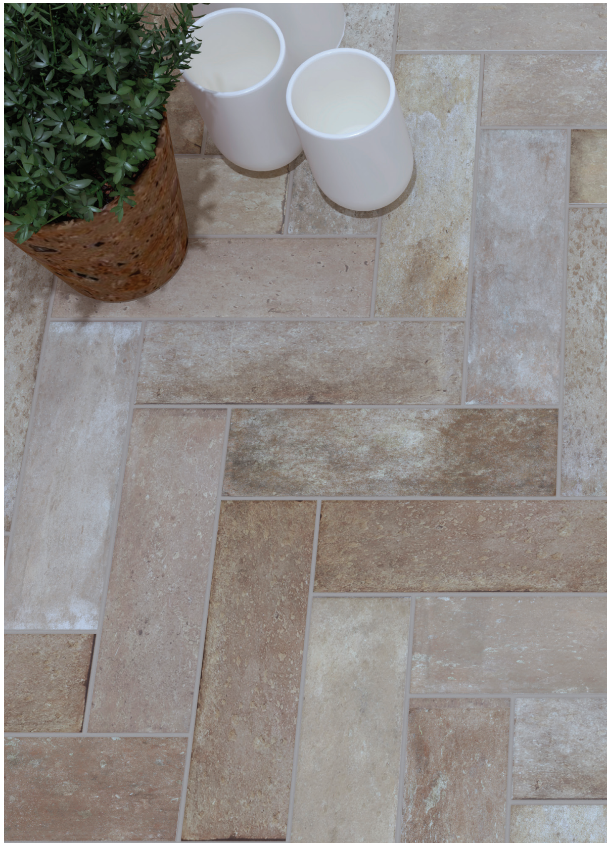
2.5" x 9" Floor/Wall Tile in Terracotta