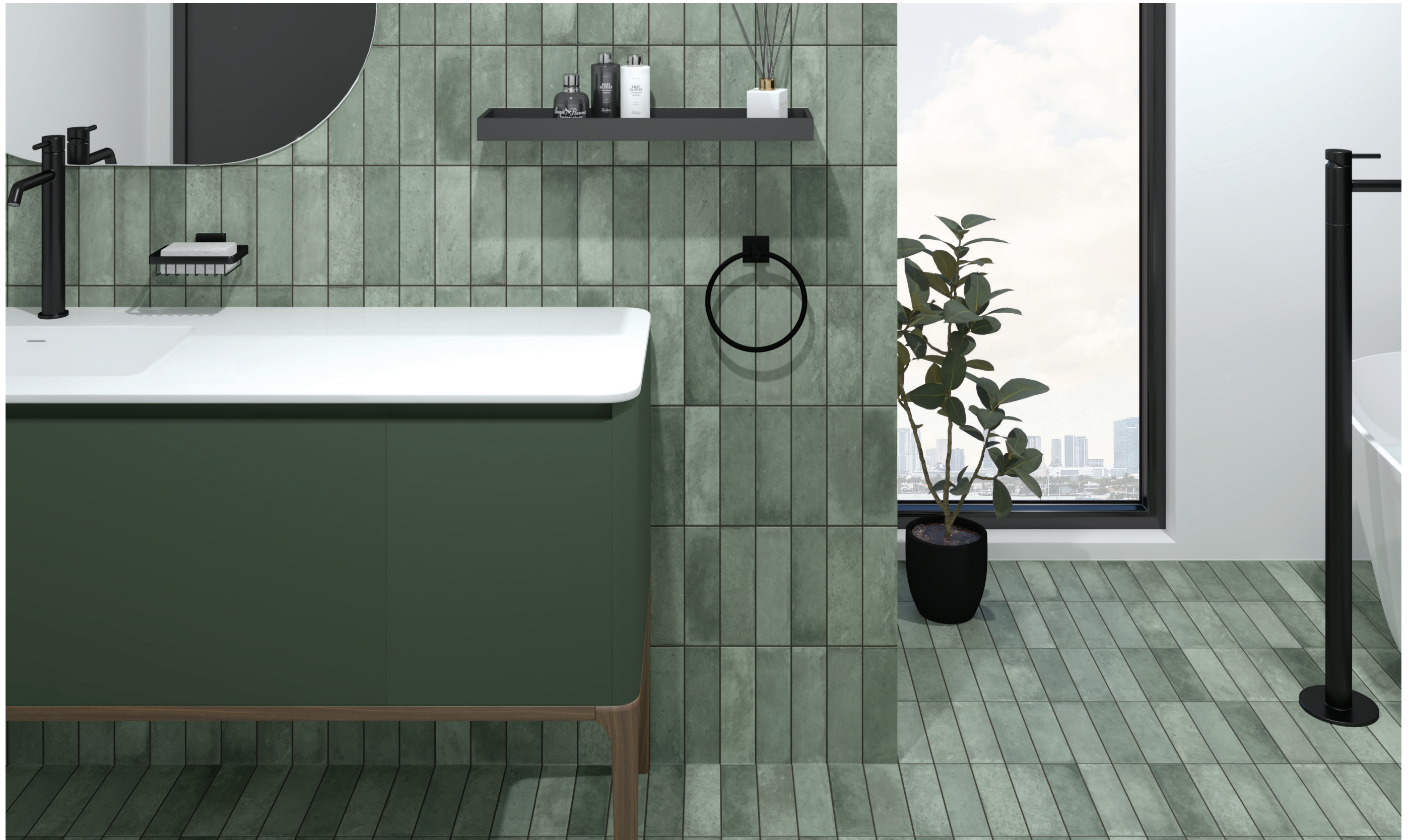
2.5" x 9" Floor/Wall Tile in Green