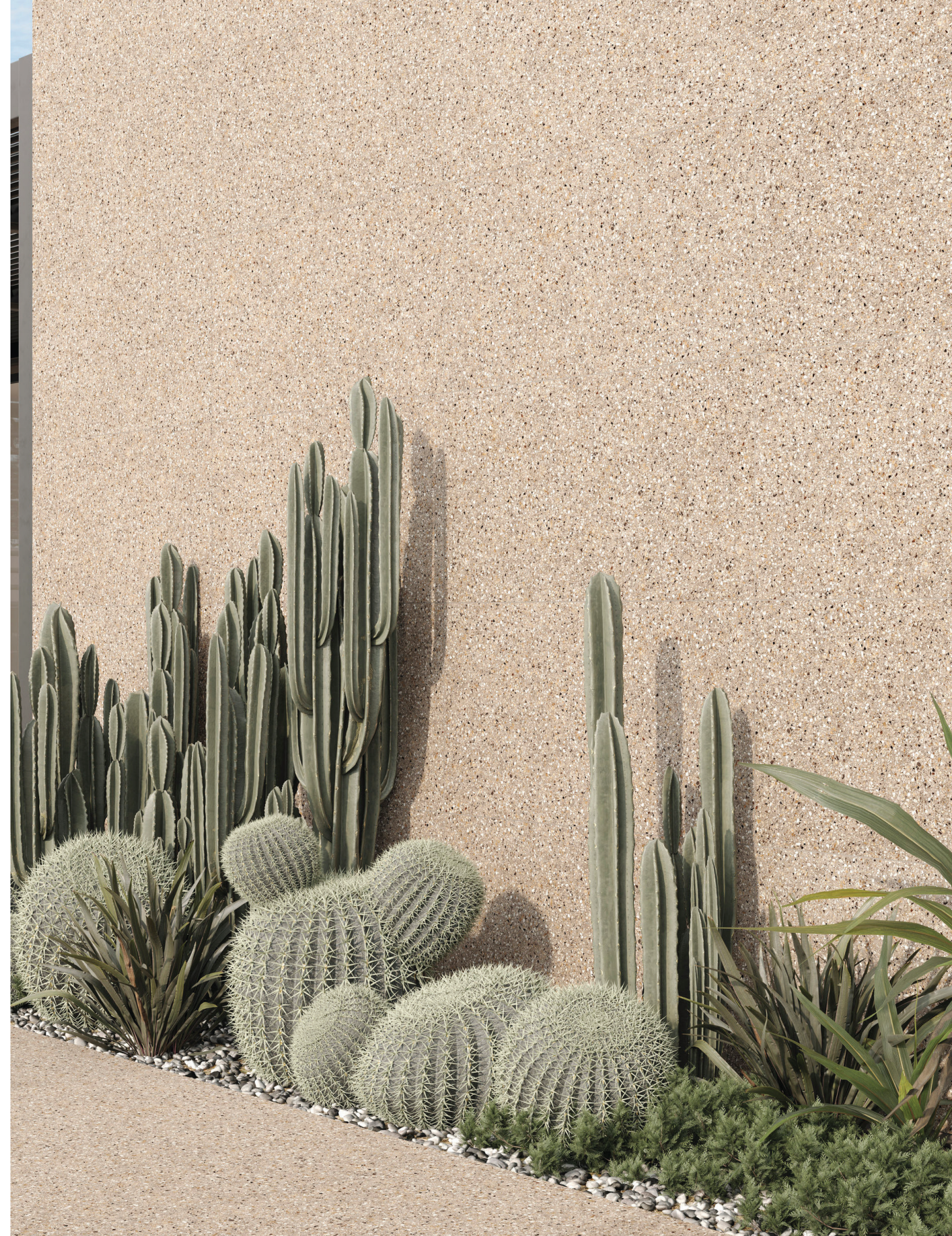
24" x 48" Floor/Wall Tile in Brown