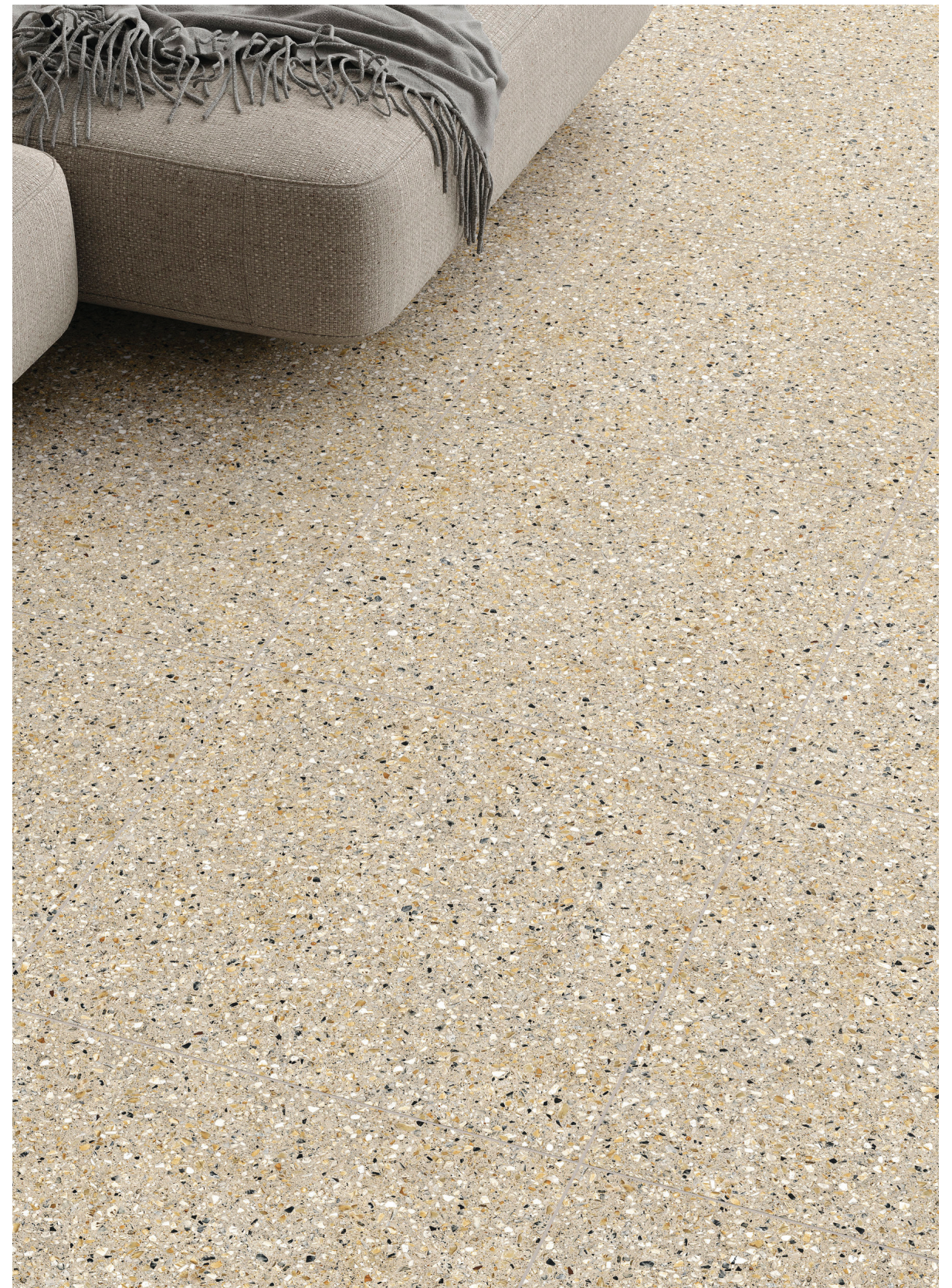
24" x 48" Floor/Wall Tile in Sand