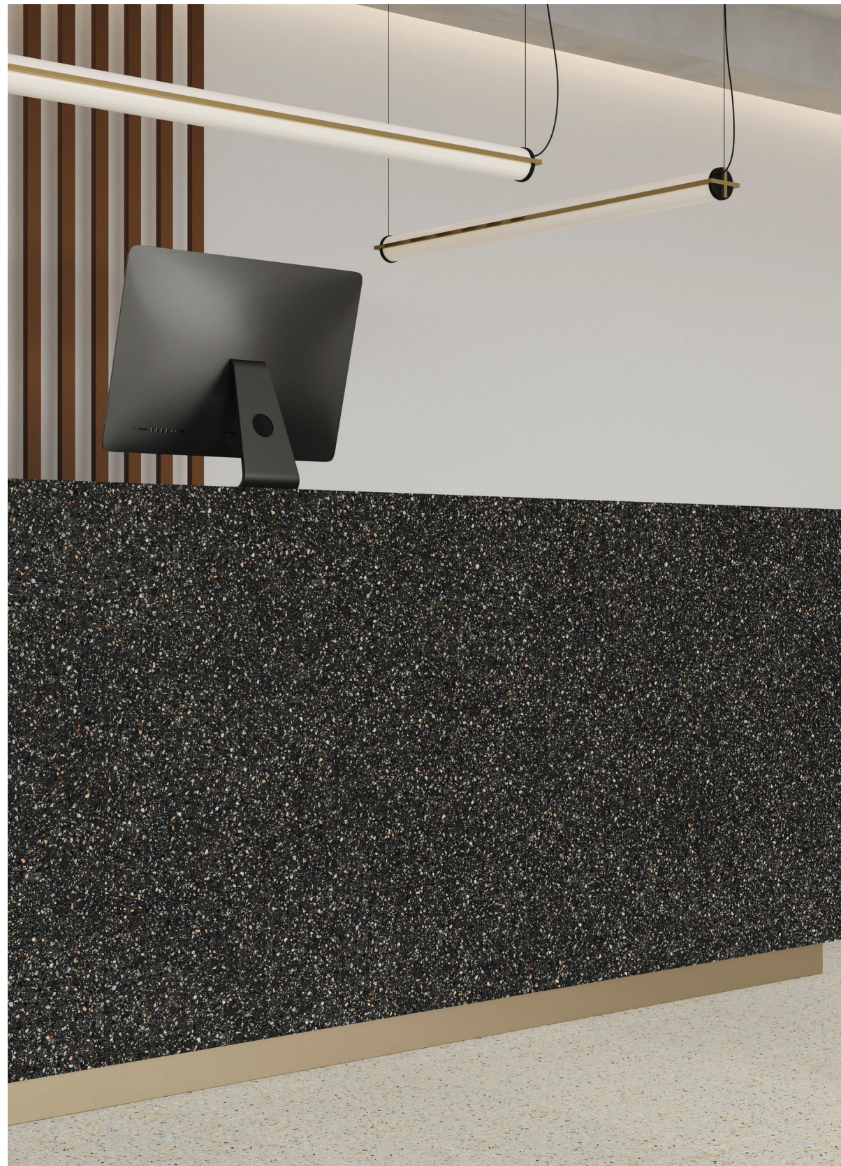
24" x 48" Floor/Wall Tile in Black