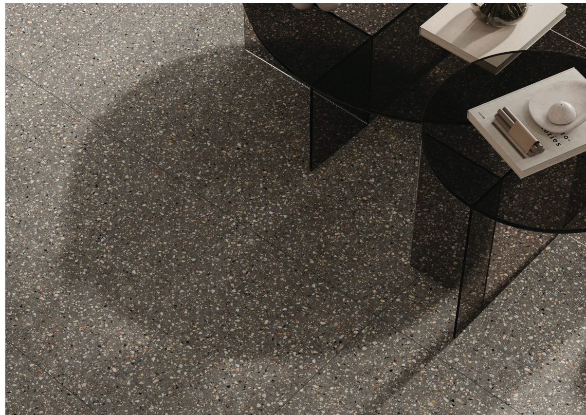
24" x 48" Floor/Wall Tile in Dark Grey