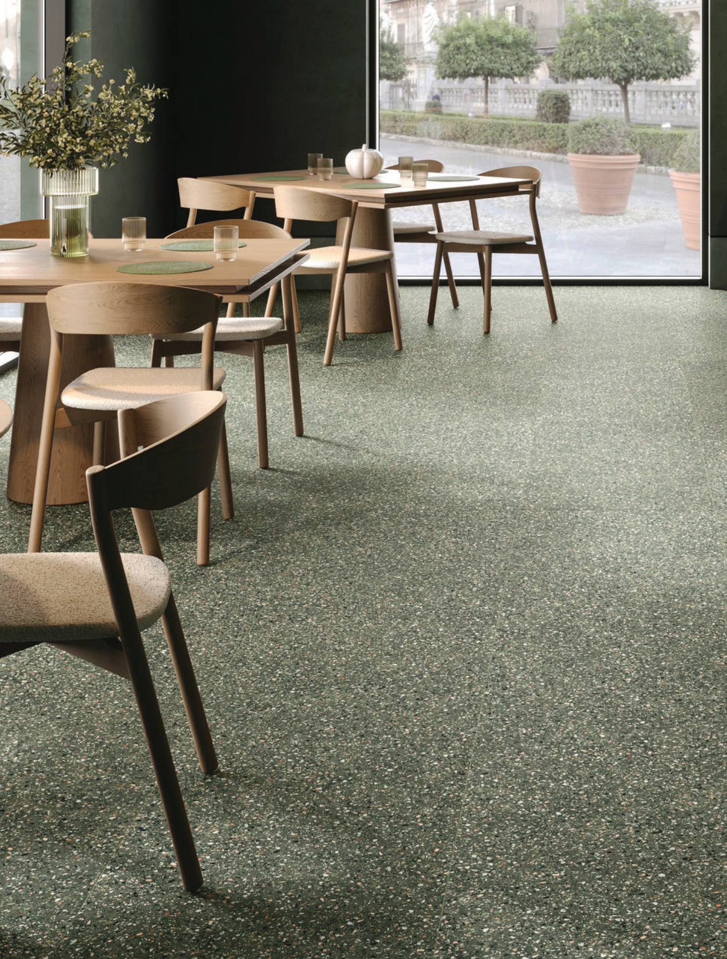
24" x 48" Floor/Wall Tile in Green