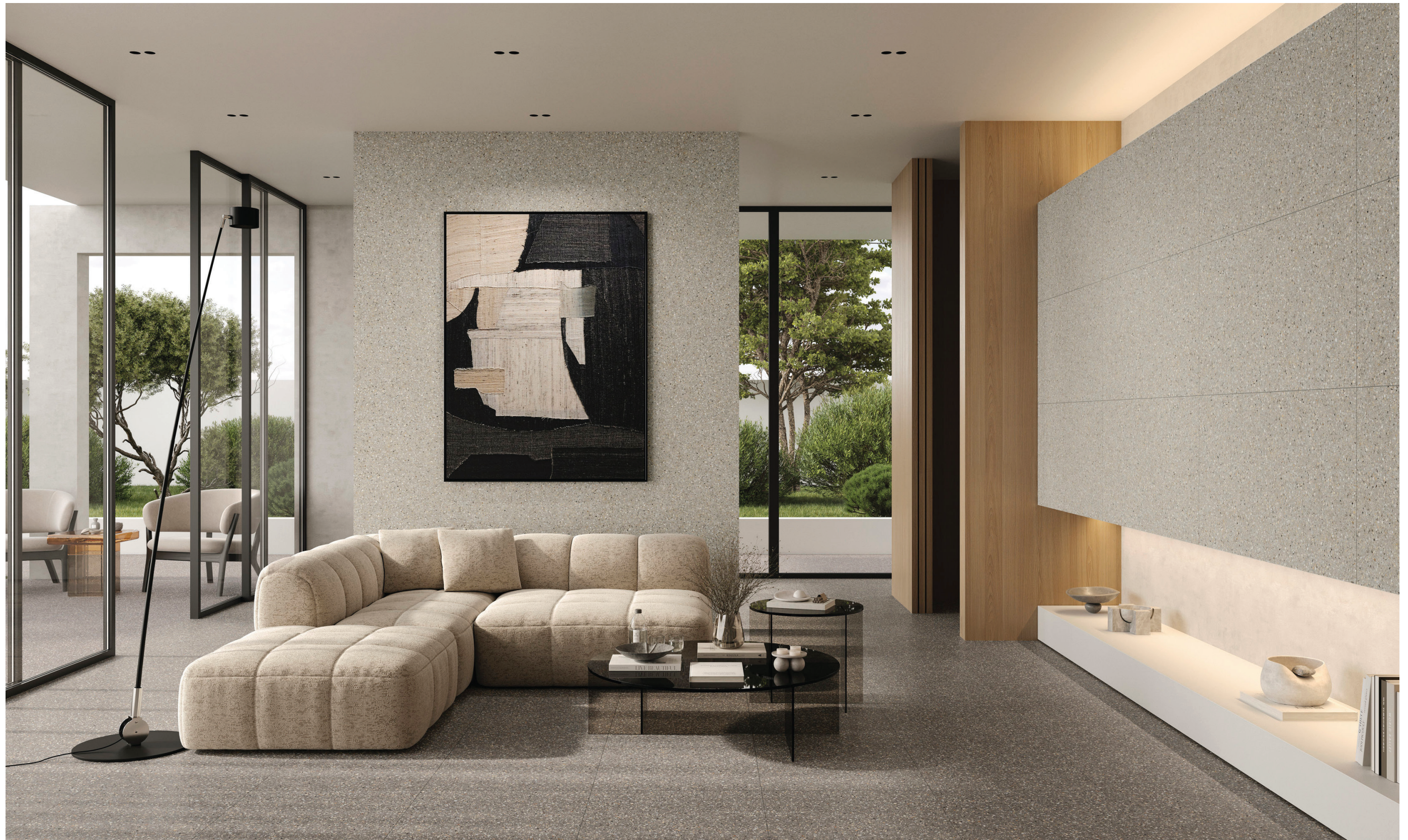
24" x 48" Floor/Wall Tile in Light Grey 24" x 48" Floor/Wall Tile in Dark Grey