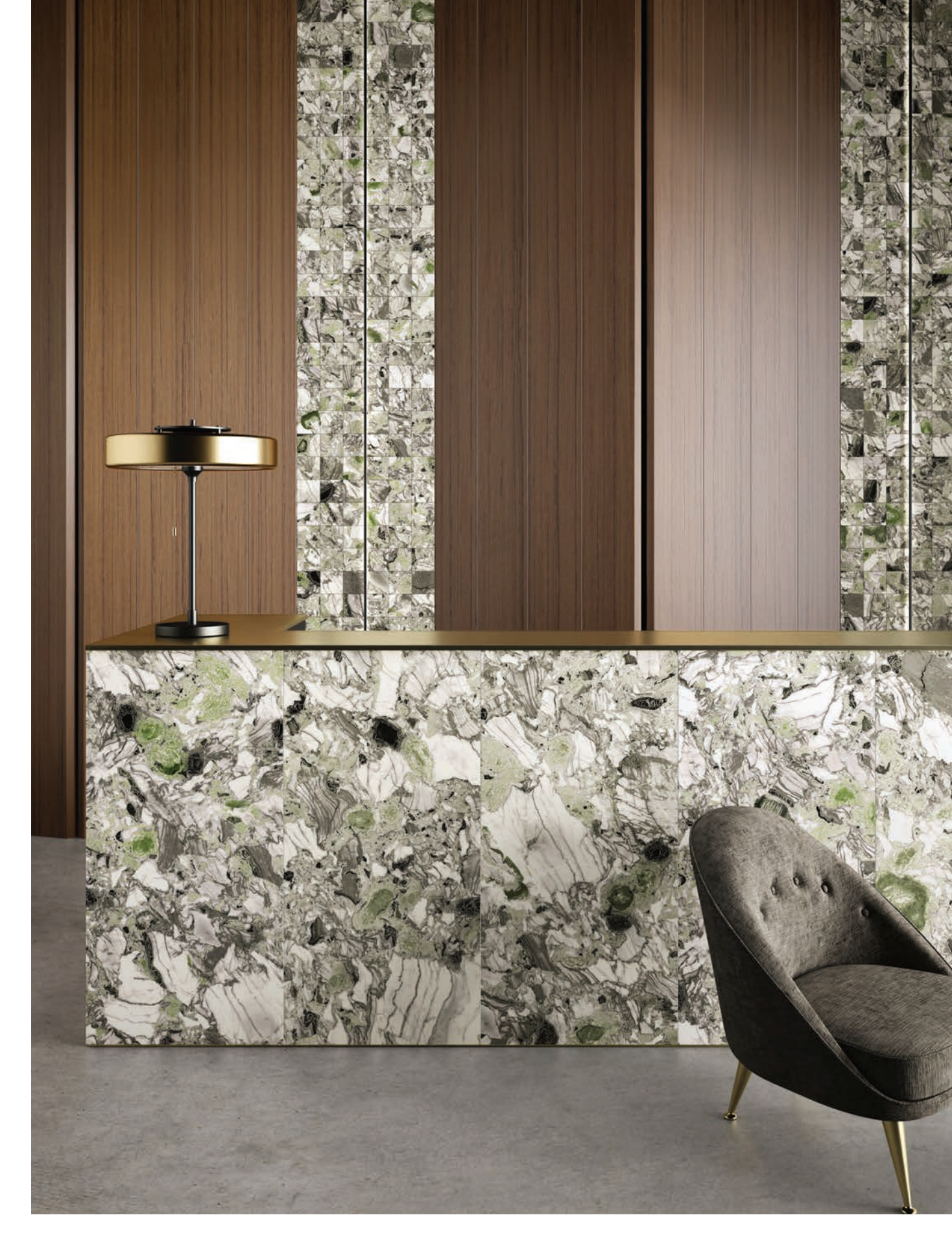
30"x 60" Field Tile in Screziato Vivace 2"x 2" Mosaic in Screziato Vivace