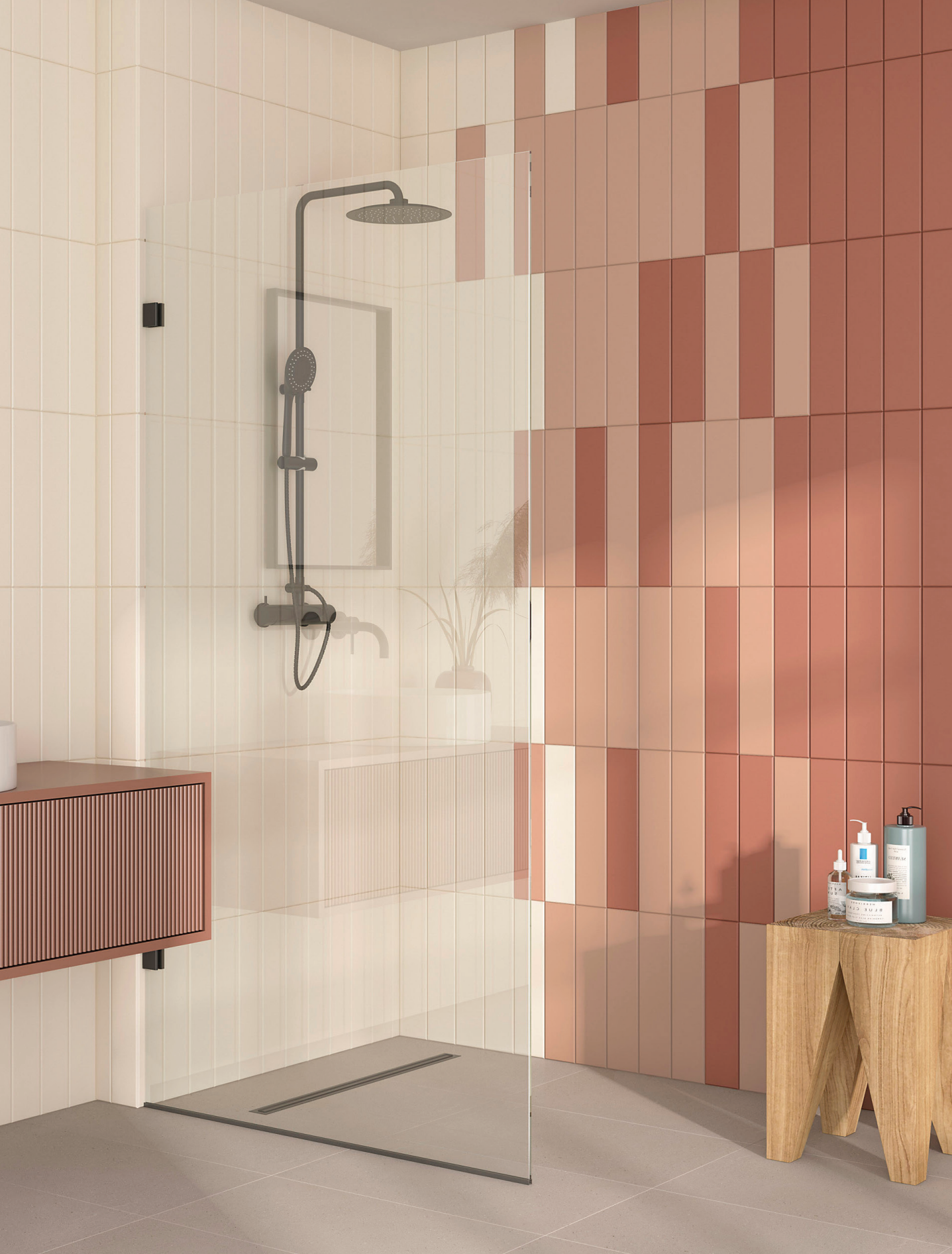
3"x 14" Wall Tile in Noronha | Sardenha | Riviera