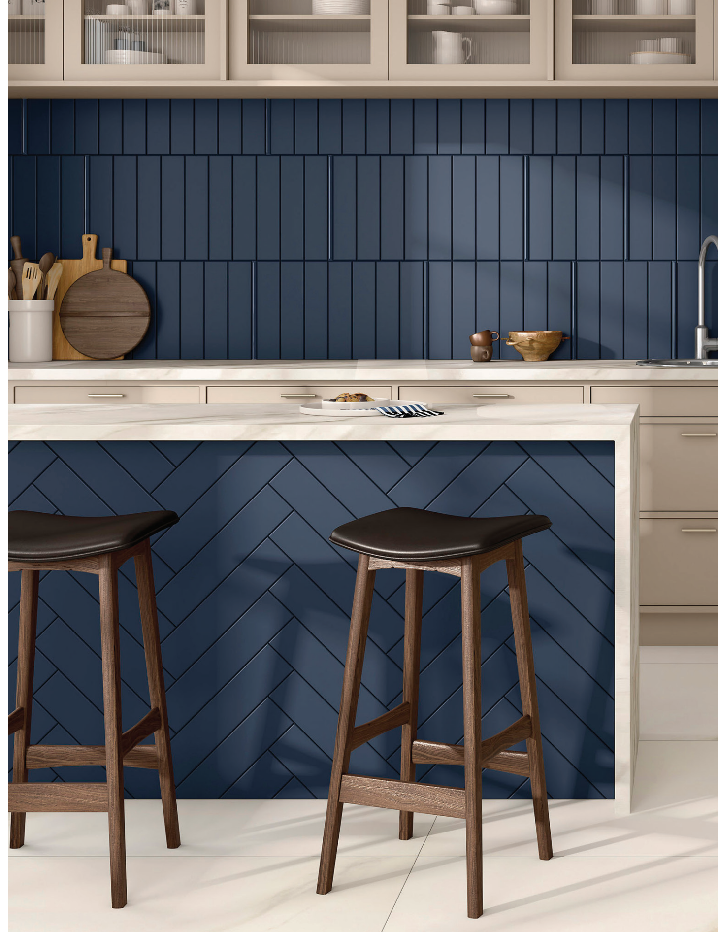
3/5"x 14" Liner in Bora Bora 3"x 14" Wall Tile in Bora Bora