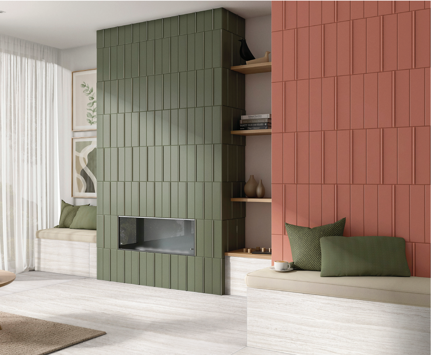
3/5" x 14" Liner in Mandacaru | Riviera 3"x 14" Wall Tile in Mandacaru | Riviera