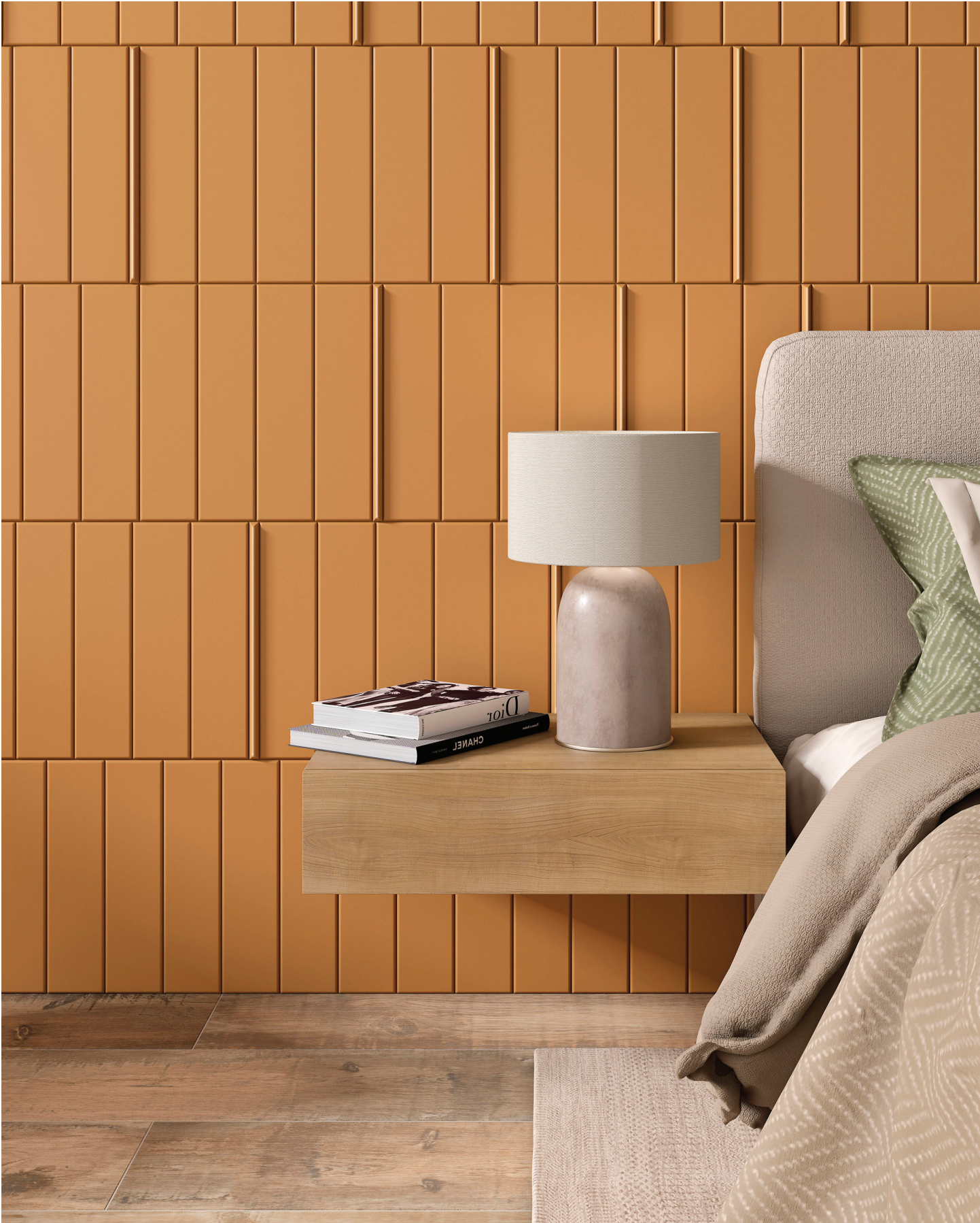
3/5"x 14" Liner in Serido 3"x 14" Wall Tile in Serido