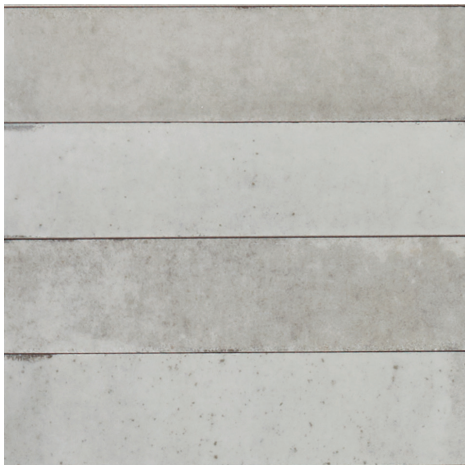
Light Grey V2