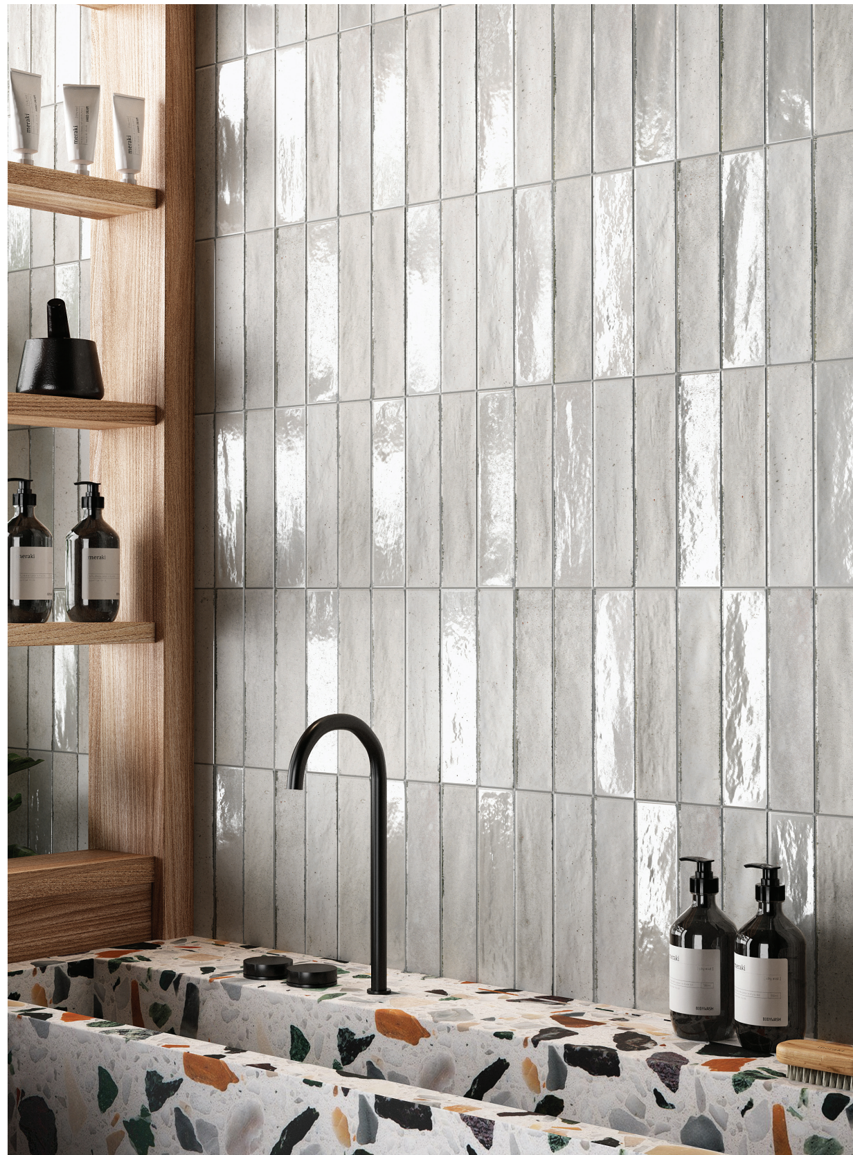
2" x 10" Floor/Wall Tile in Light Grey