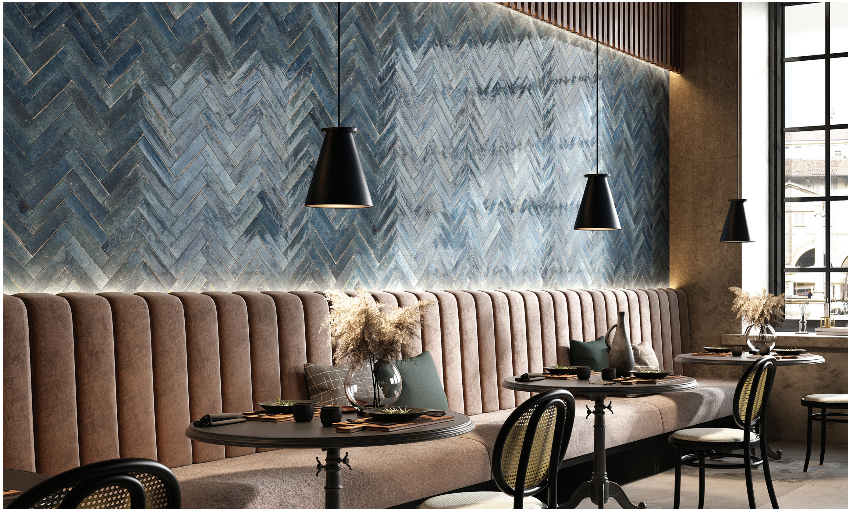
2" x 10" Floor/Wall Tile in Blu