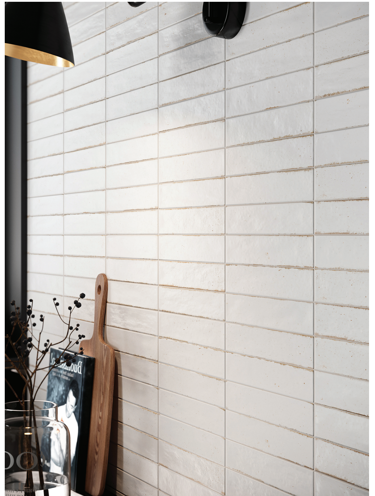
2" x 10" Floor/Wall Tile in White