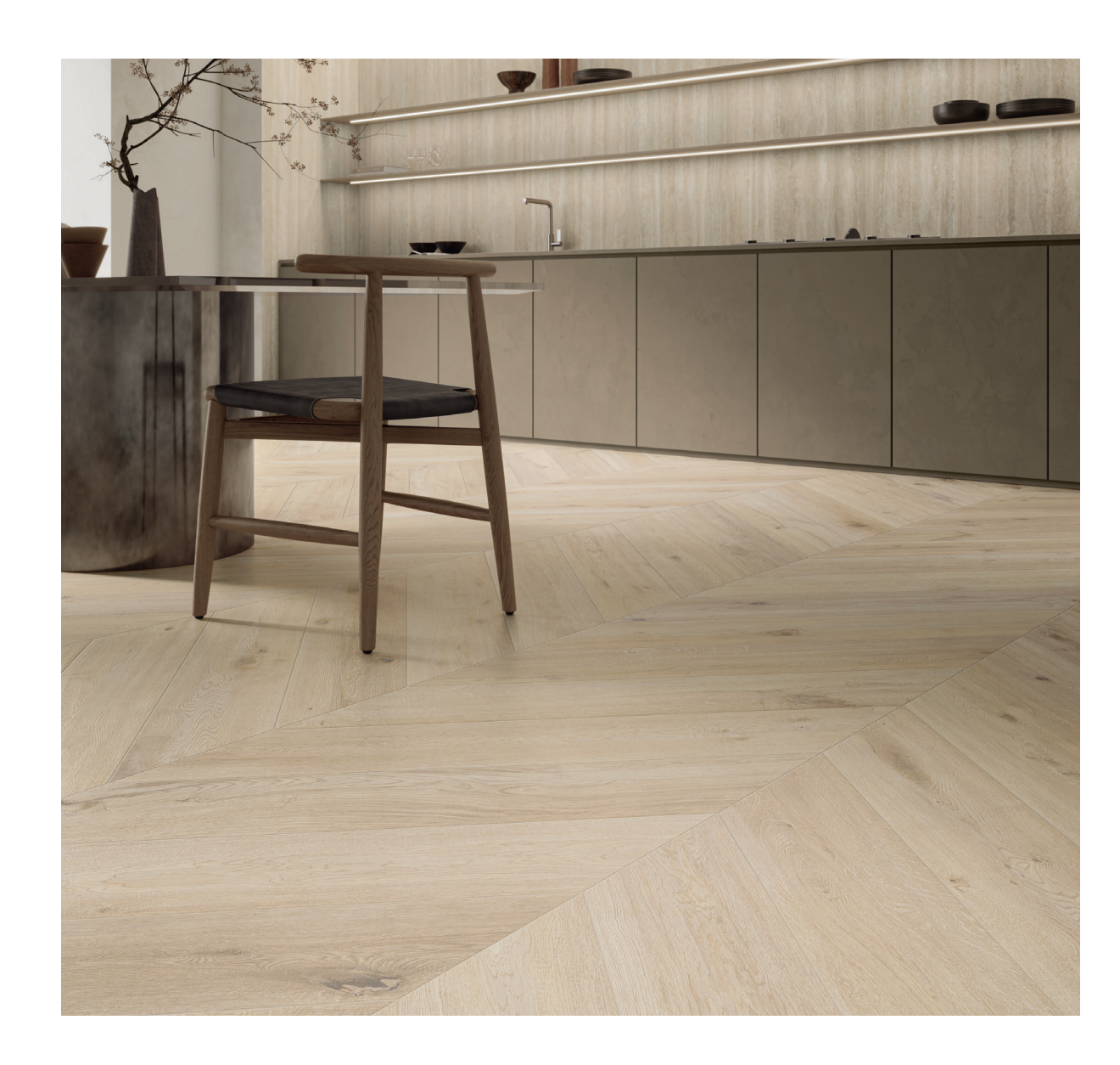
8" x 48" Chevron Field Tile in Almond