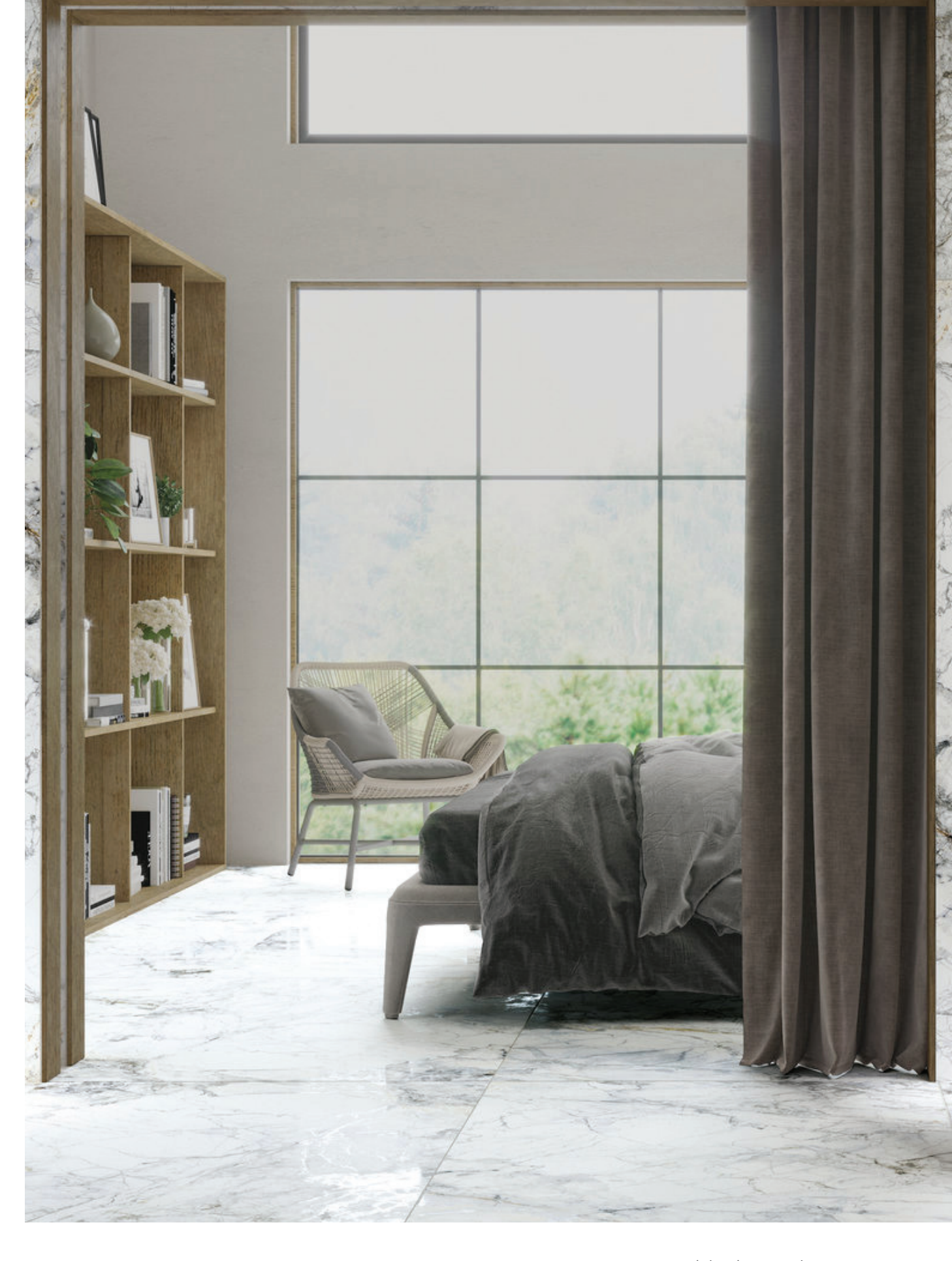
40"x70" 8mm Field Tile in White 40"x70" 8mm Available in: Brushed/Shaped | Premium Polished Finish