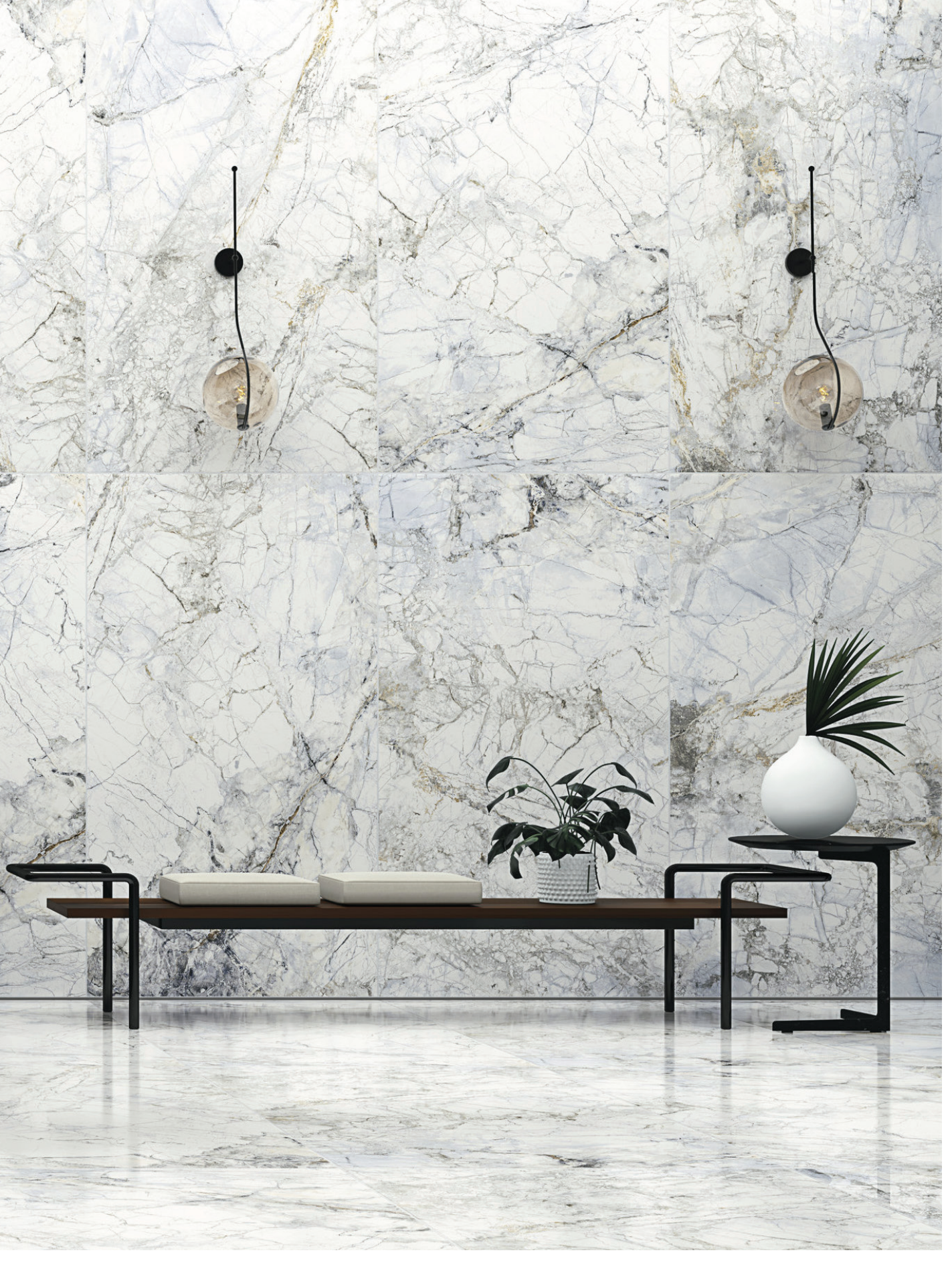
40"x70" 8mm Field Tile - Available in: Brushed/Shaped | Premium Polished Finish 30"x60" 10mm Field Tile - Available in: Matte | Polished Finish