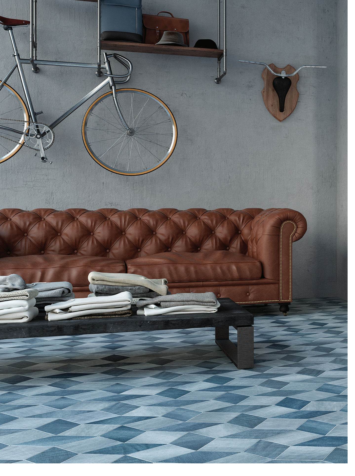
5.5"x5.5" Field Tile in Washed Blue 5.5"x5.5" Diamond Field Tile in Indigo