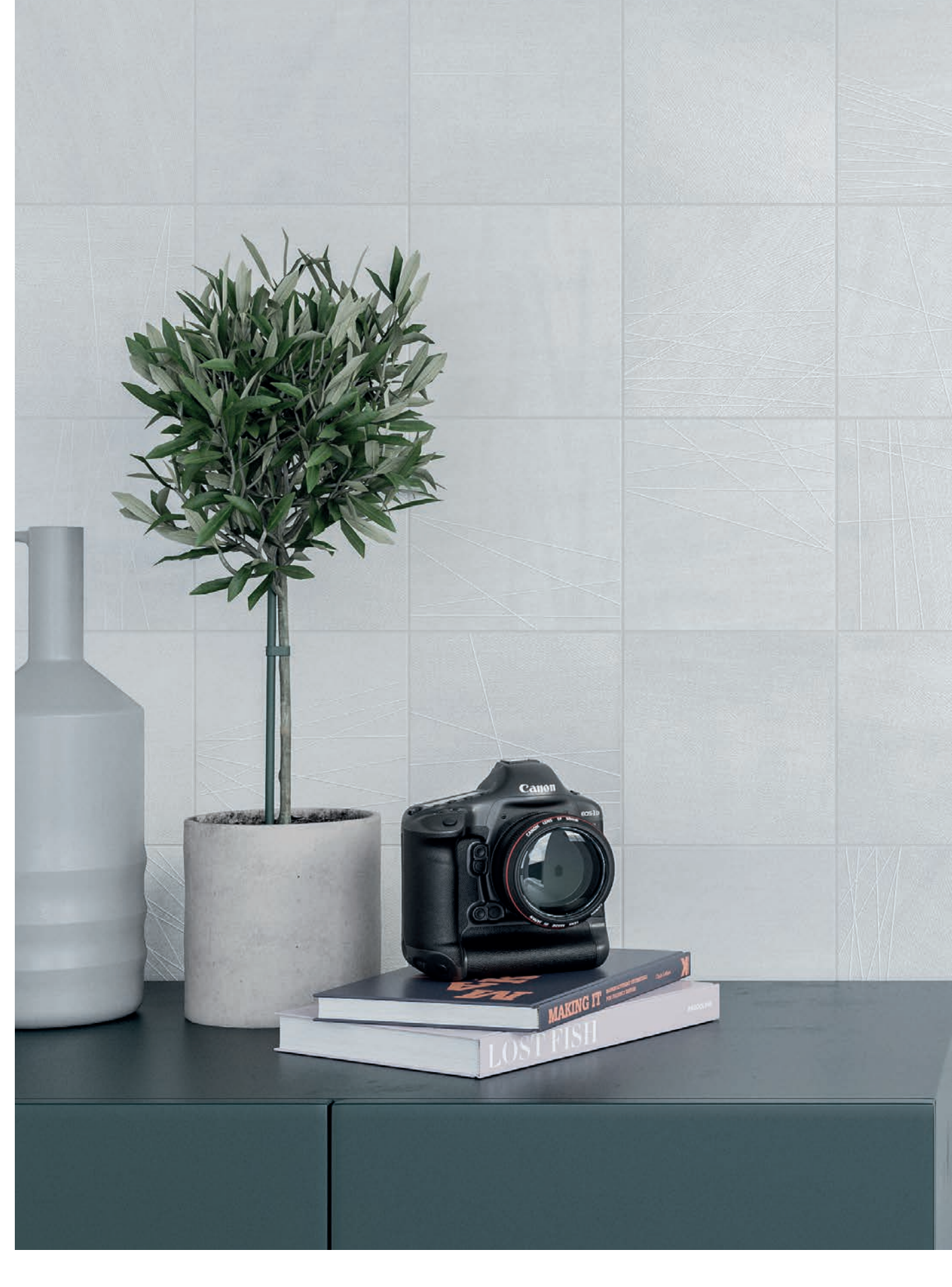
5.5"x5.5" Field Tile in White 5.5"x5.5" Deco in White