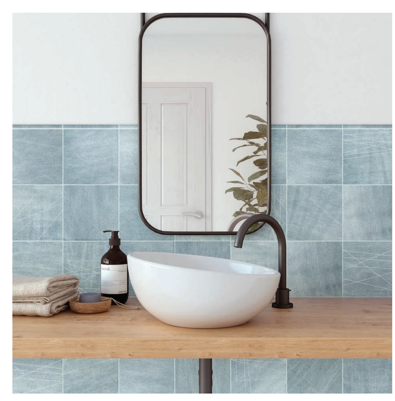
5.5" Quartino in Washed Blue 5.5"x5.5" Field Tile in Washed Blue 5.5"x5.5" Deco in Washed Blue