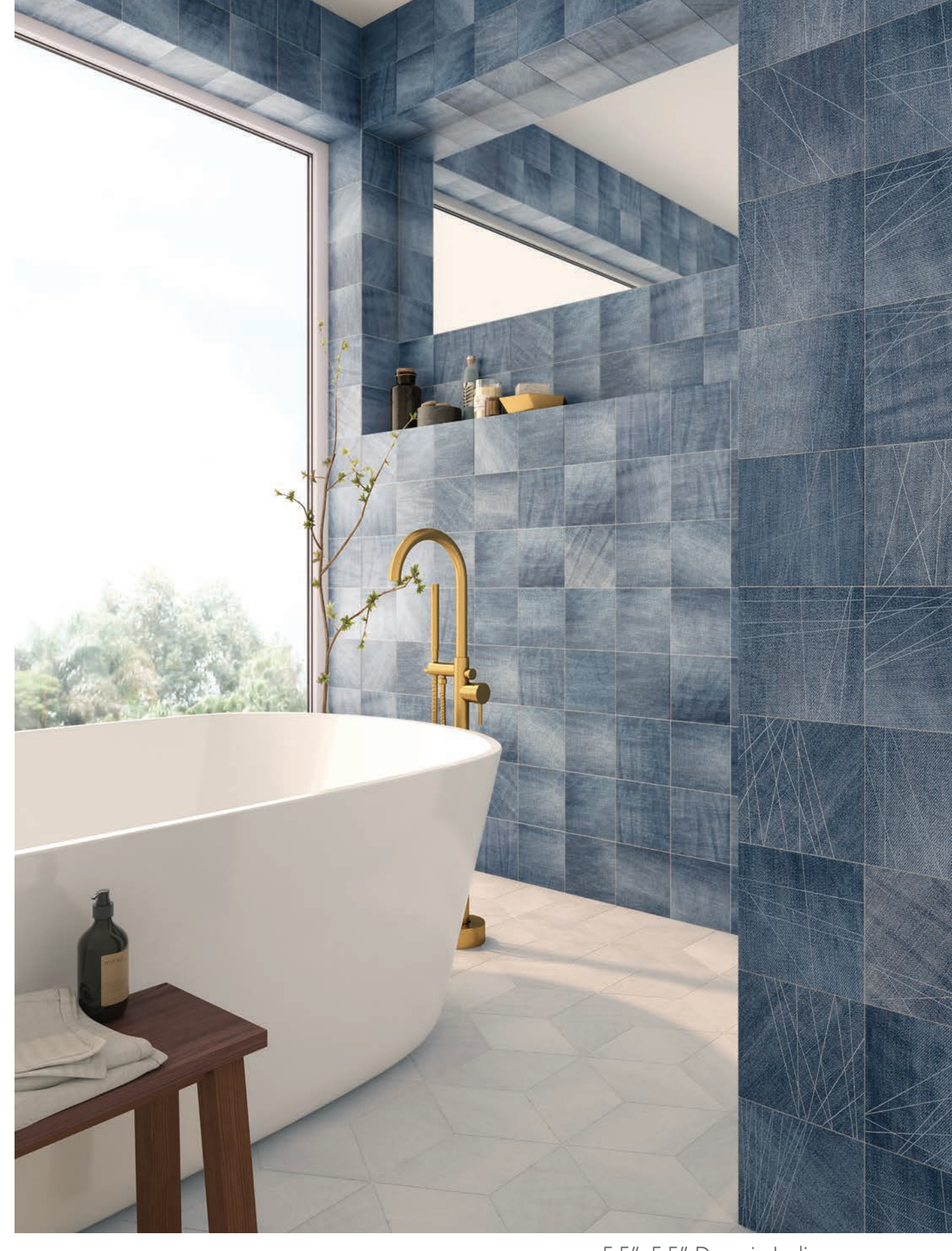
5.5"x5.5" Deco in Indigo 5.5"x5.5" Field Tile in Indigo 5.5"x5.5" Diamond Field Tile in White