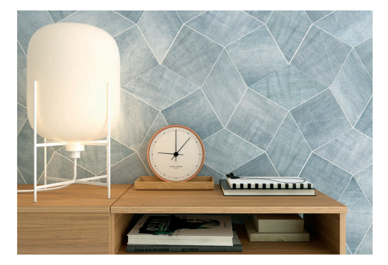
5.5"x5.5" Field Tile in Washed Blue 5.5"x5.5" Diamond Field Tile in Washed Blue