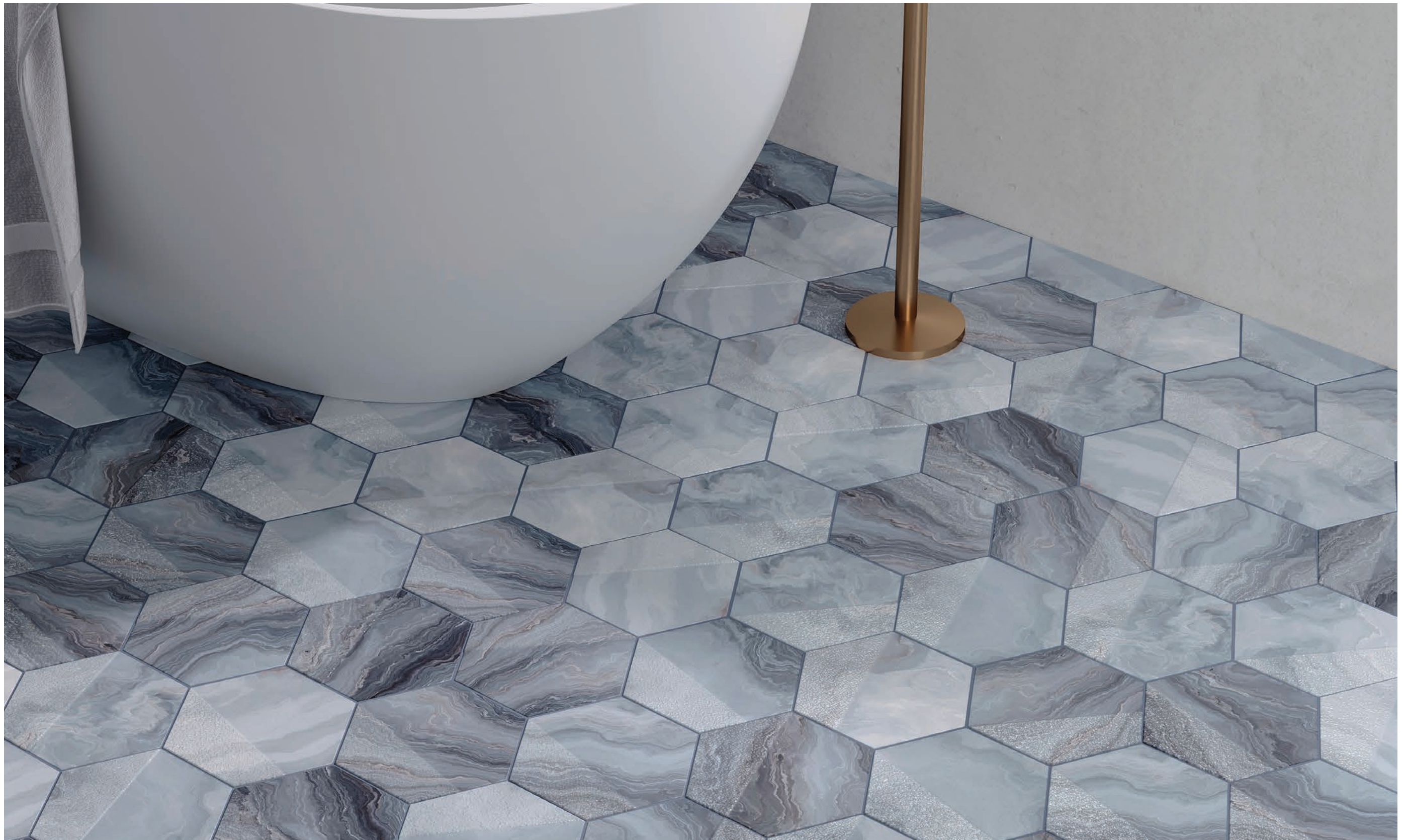
5.5" x 6.5" Floor/Wall Tile in Aguamarina