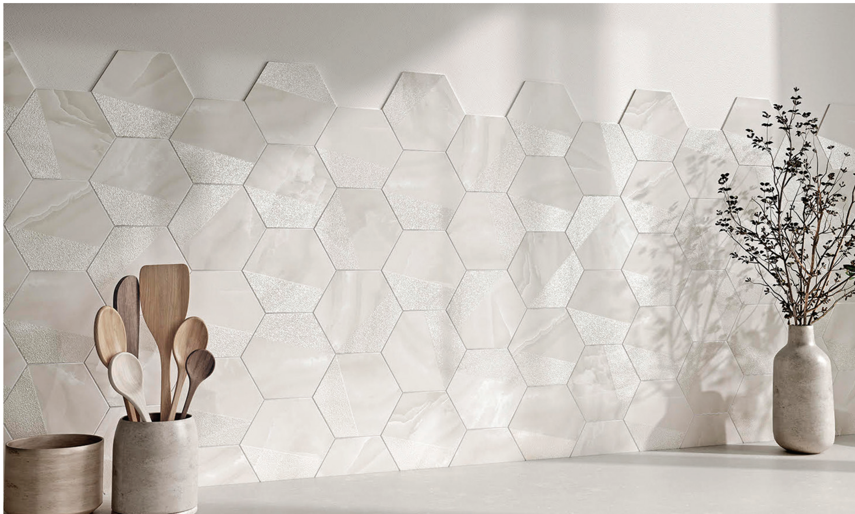
5.5" x 6.5" Floor/Wall Tile in White