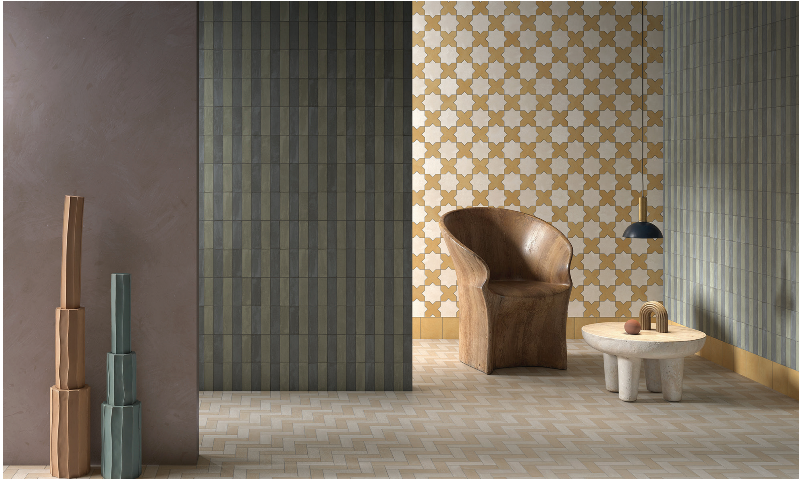
6.5" Star Floor/Wall Tile in Frosted Linen 5" Cross Floor/Wall Tile in Golden Sky 6" x 6" Floor/Wall Tile in Sahara Sand 2" x 6" Floor/Wall Tile in Saltwater