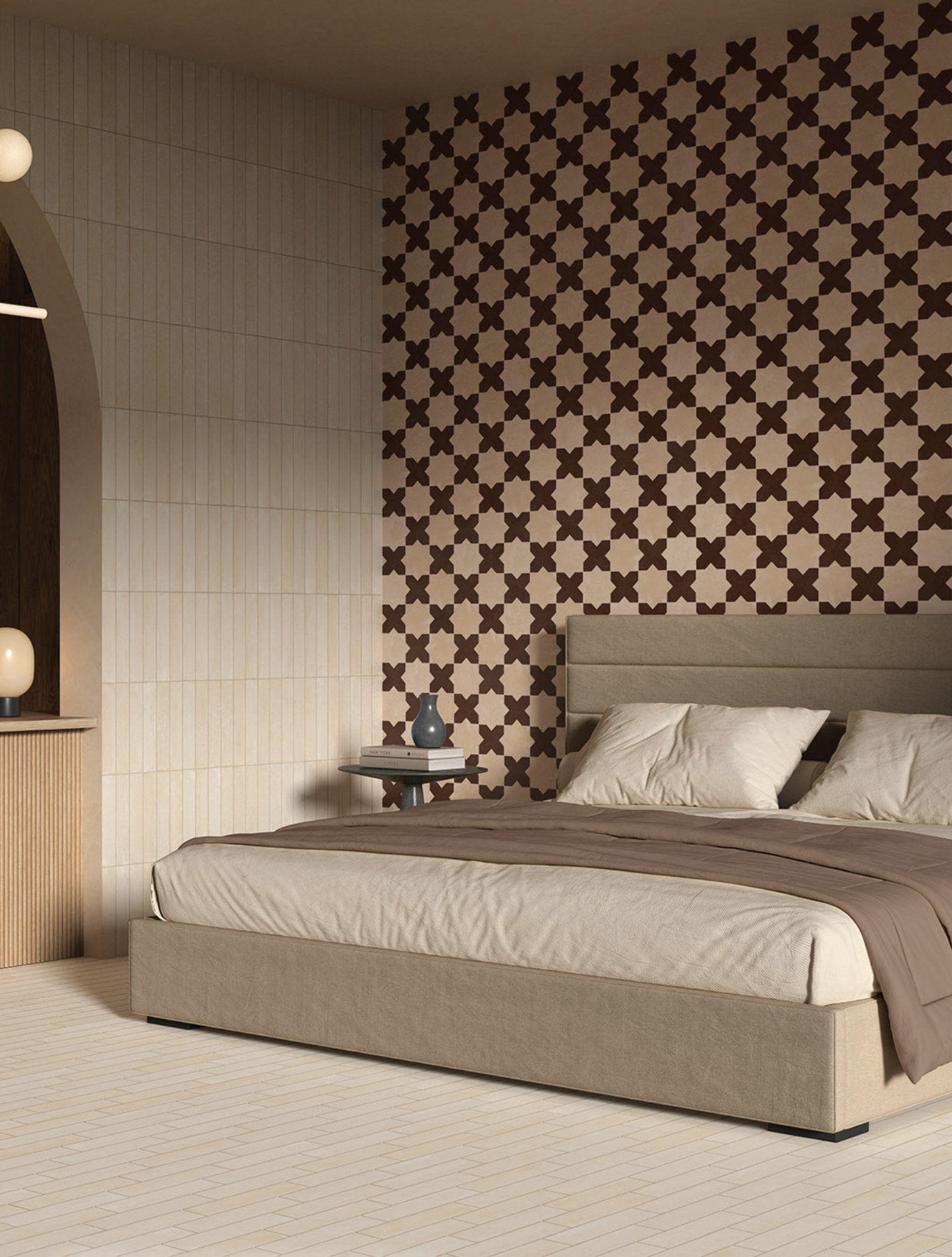
6.5" Star Floor/ Wall Tile in Dusty Rose 5" Cross Floor/ Wall Tile in Almond Mist 2" x 6" Floor/ Wall Tile in Midnight Slate