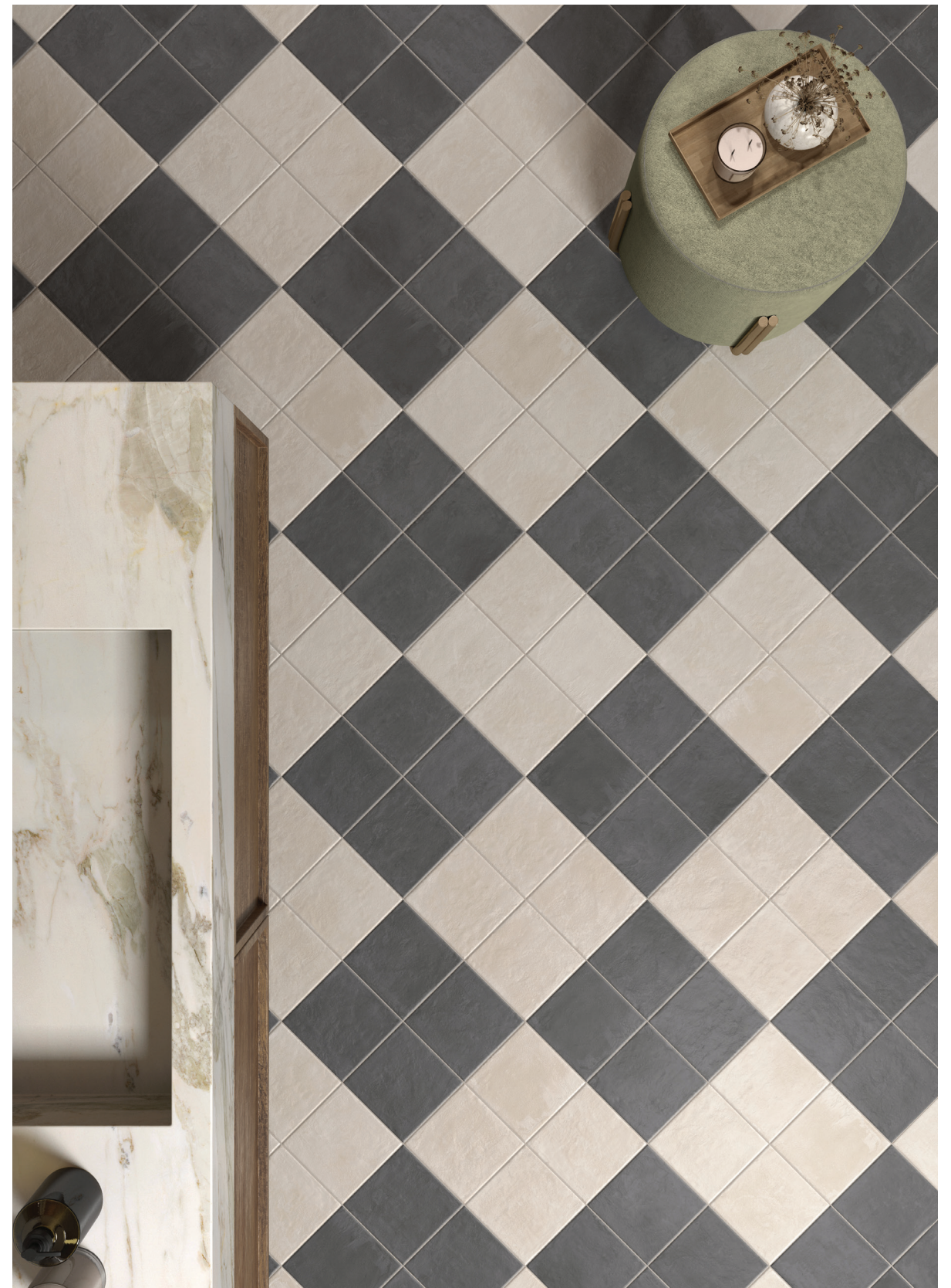
6" x 6" Floor/ Wall Tile in Frosted Linen 6" x 6" Floor/ Wall Tile in Midnight Slate