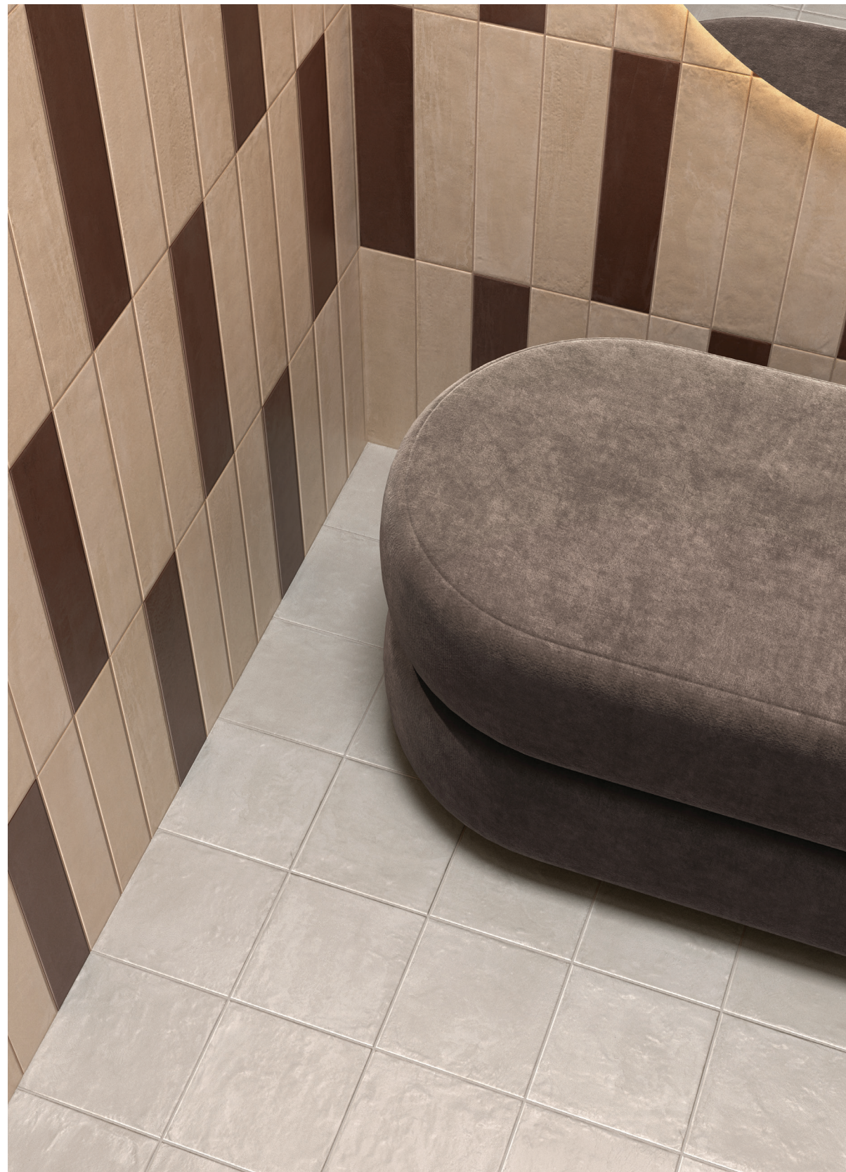
6" x 6" Floor/ Wall Tile in Dusty Rose 2.5" x 12" Floor/Wall Tile in Burnt Umber