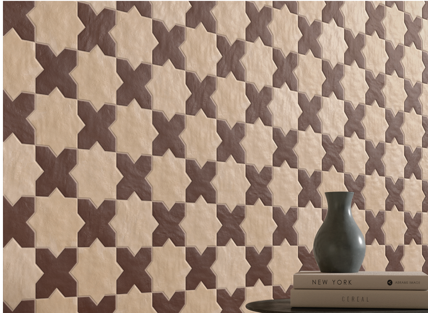
6.5" Star Floor/ Wall Tile in Dusty Rose 5" Cross Floor/Wall Tile in Burnt Umber