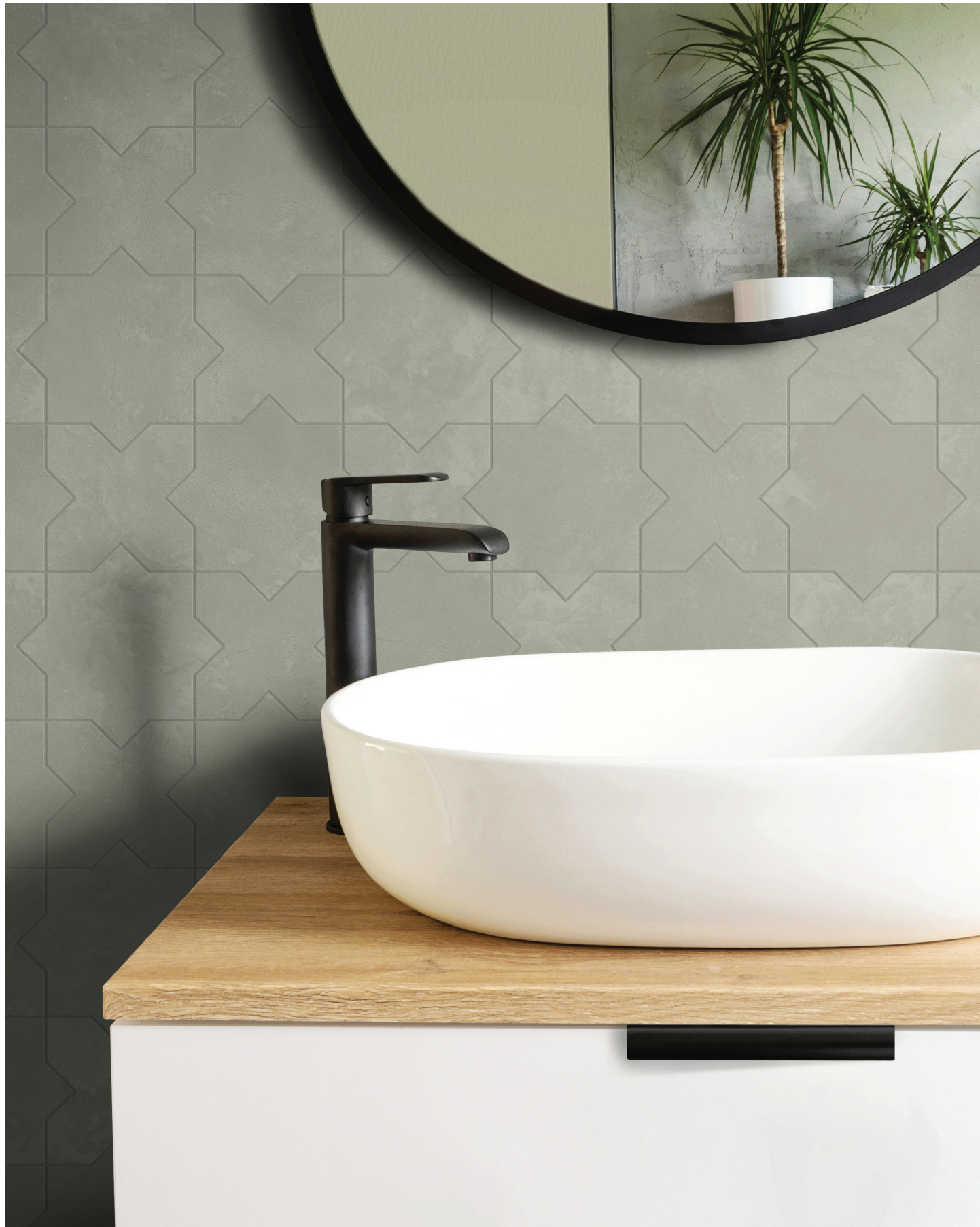
6.5" Star Floor/ Wall Tile in Soft Sage 5" Cross Floor/Wall Tile in Soft Sage