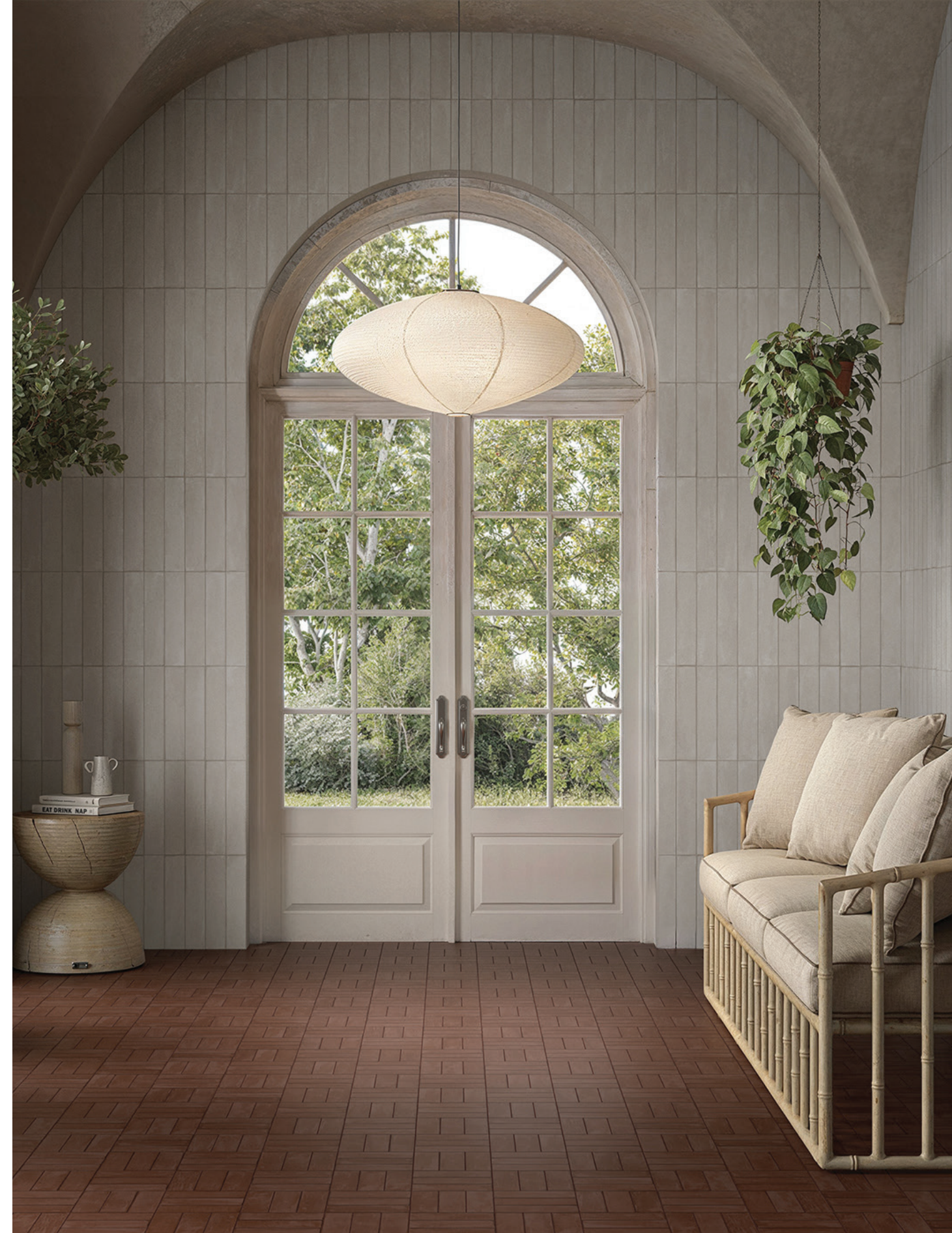
2.5" x 12" Floor/ Wall Tile in Silverstone 2" x 6" Floor/Wall Tile in Burnt Umber