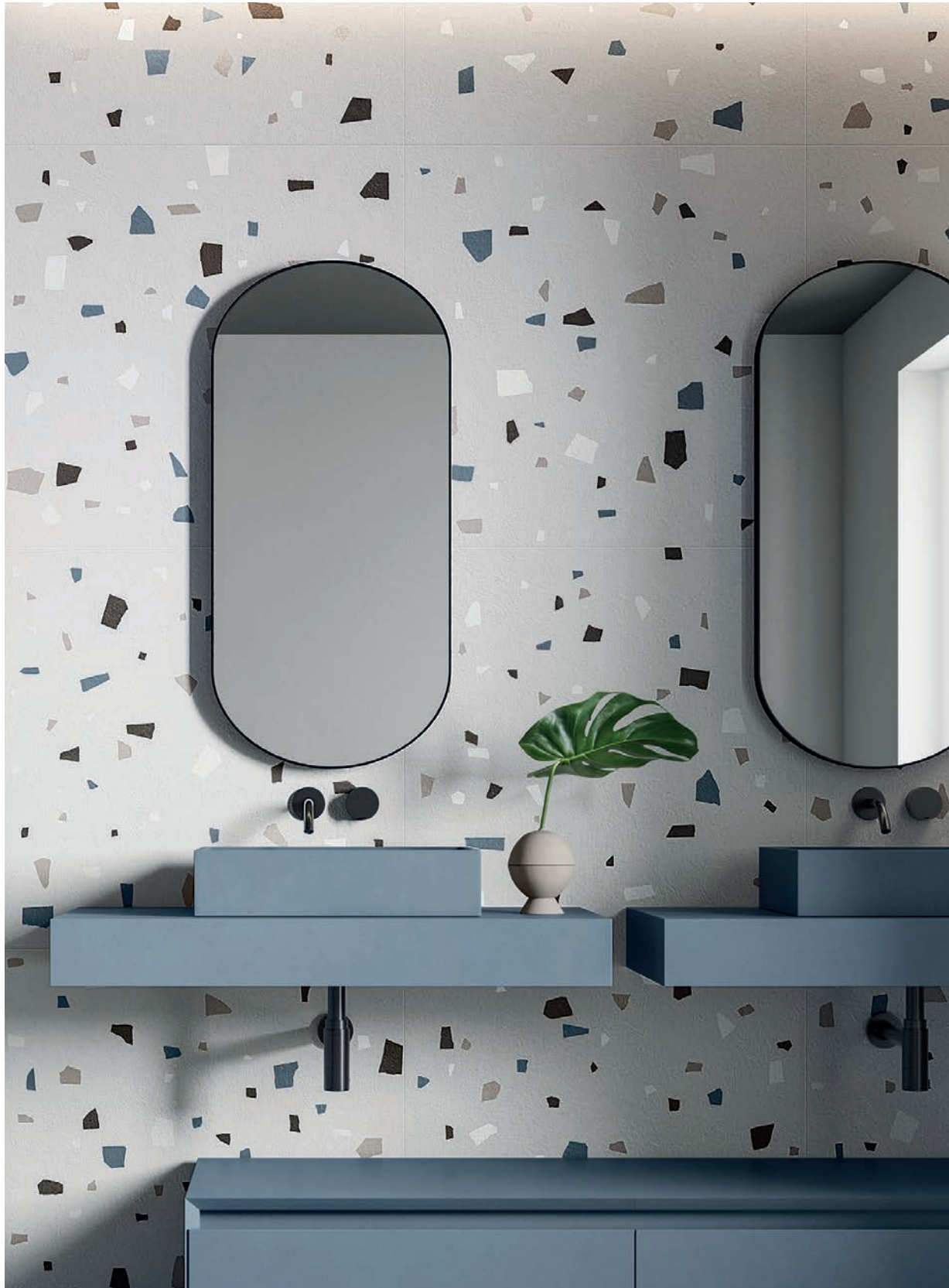
32"x32" Coccio Field Deco in Bianco