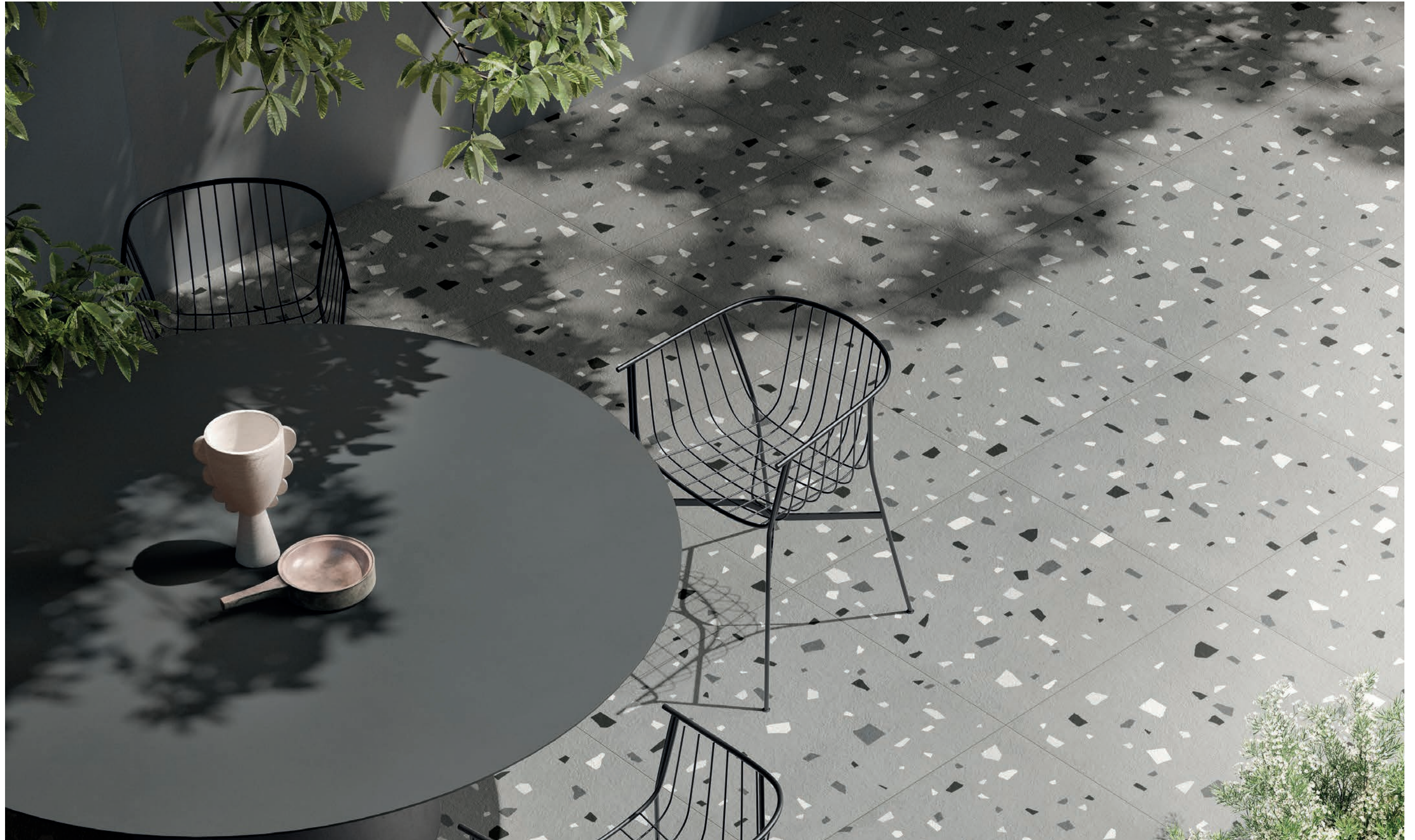
32" x 32" Coccio Field Deco in Grigio