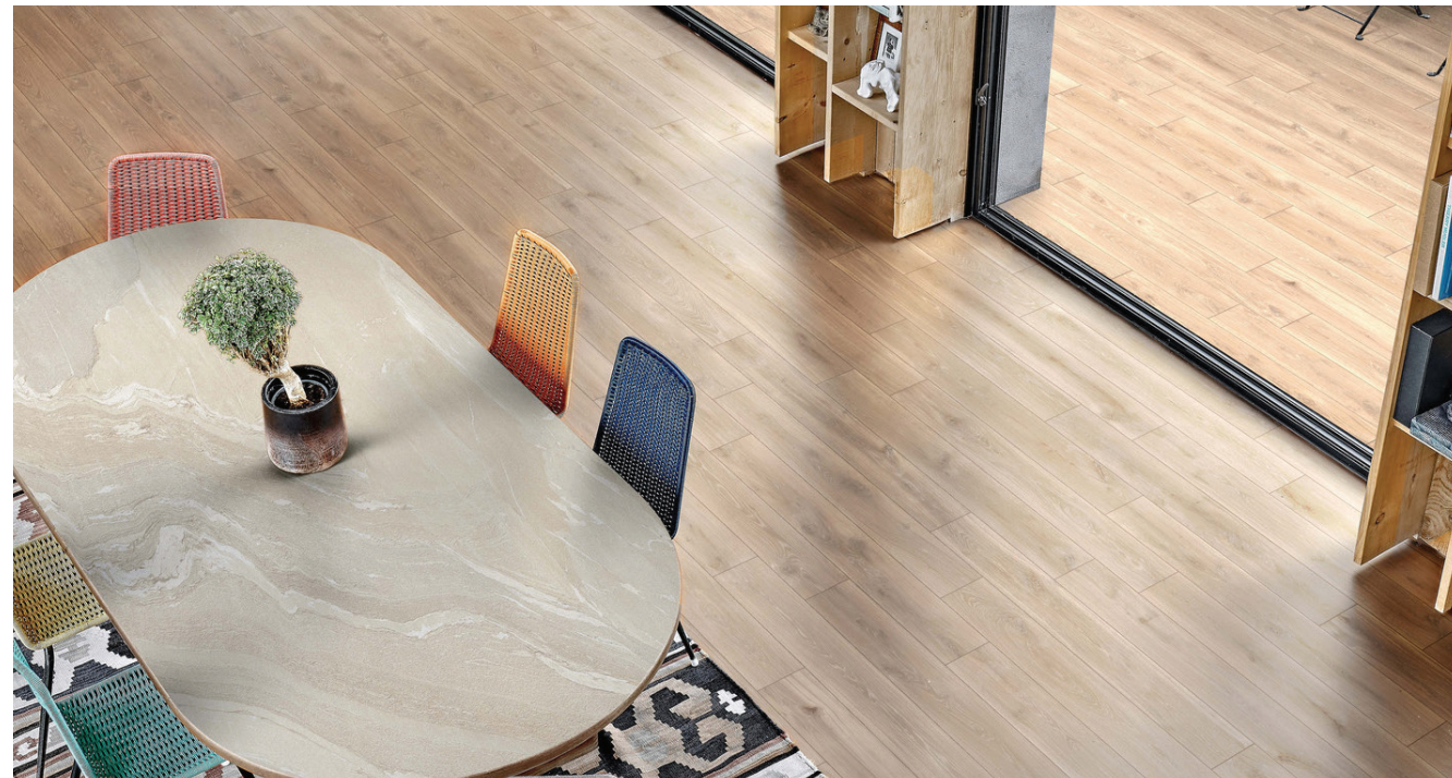
8" x 48" Floor/Wall Tile in Champagne