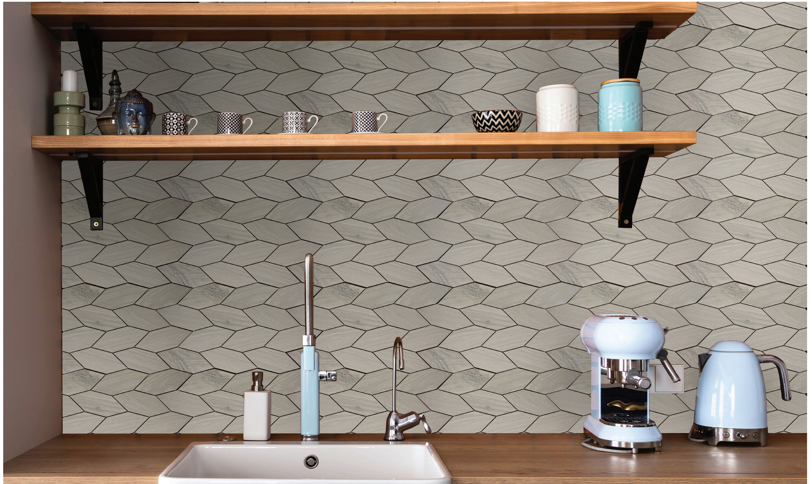
Leaf Mosaic in Dune