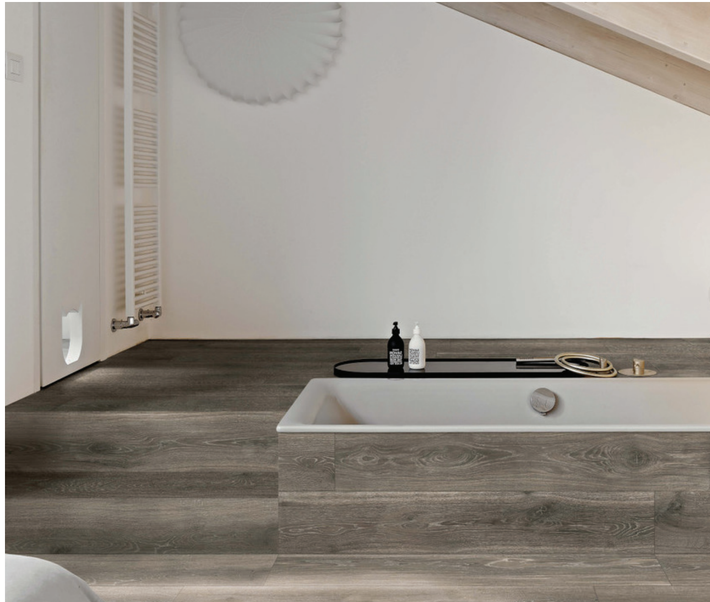
8" x 48" Floor/Wall Tile in Woodchunk