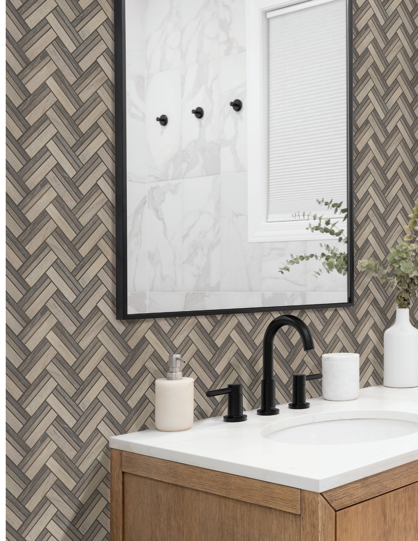
Herringbone Mosaic in Dune (Dune | Nutmeg | Champagne)