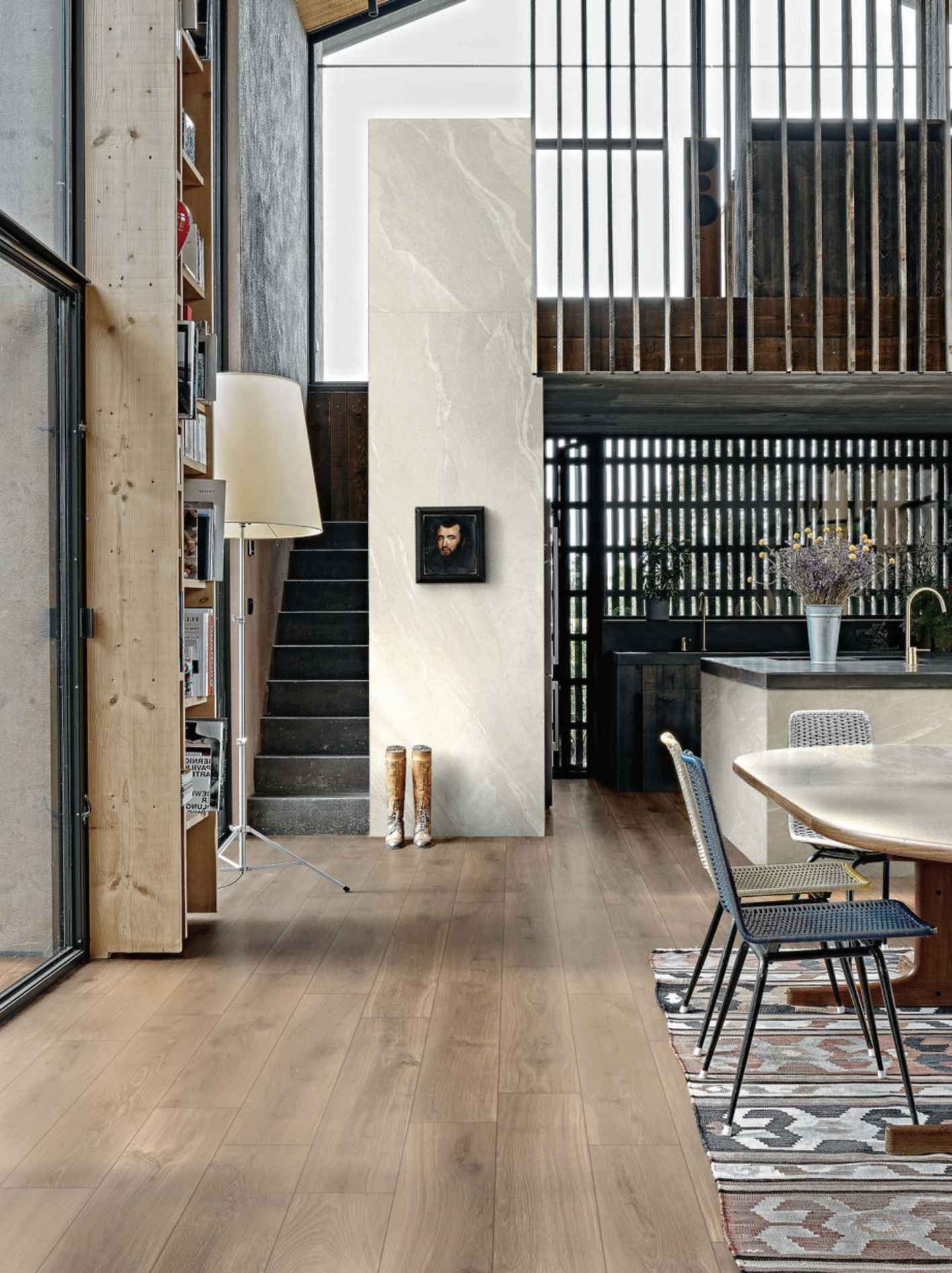
8" x 48" Floor/Wall Tile in Champagne