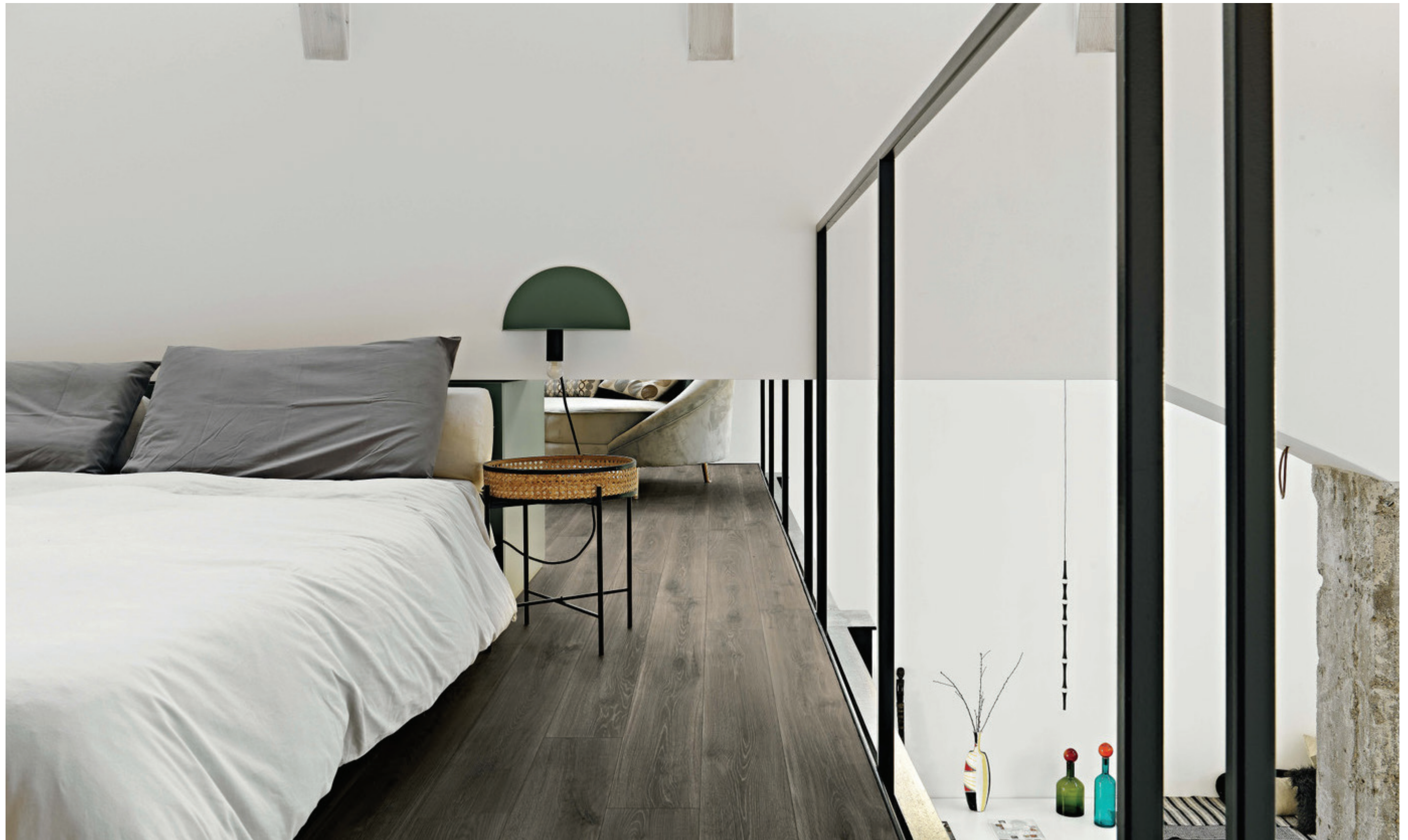
8" x 48" Floor/Wall Tile in Woodchunk