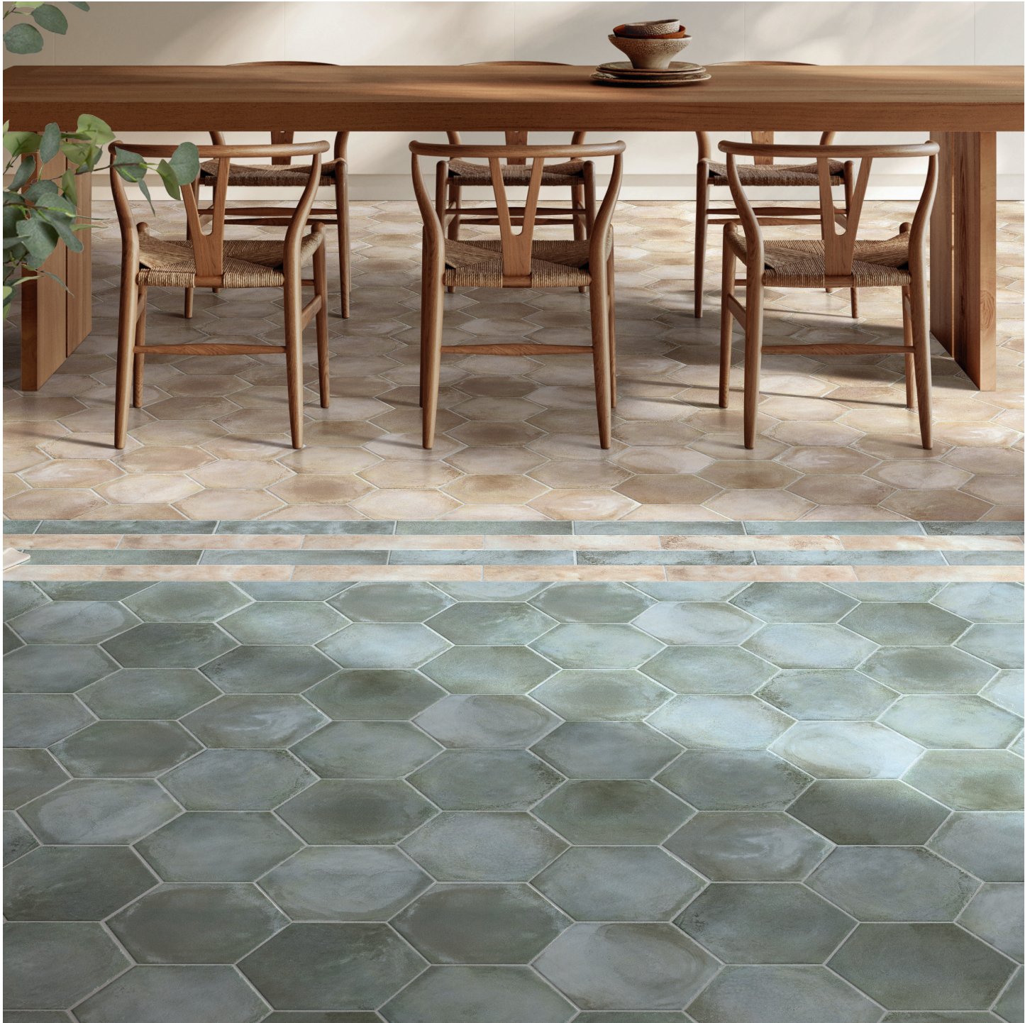
9.5 " x 11" Hexagon | 4" x 16" Floor/Wall Tile in Sabbia 9.5 " x 11" Hexagon | 4" x 16" Floor/Wall Tile in Verde