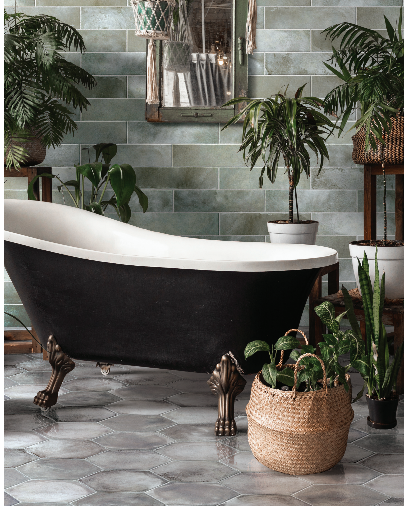
9.5" x 11" Hexagon in Perla | 4" x 16" Floor/Wall Tile in Verde