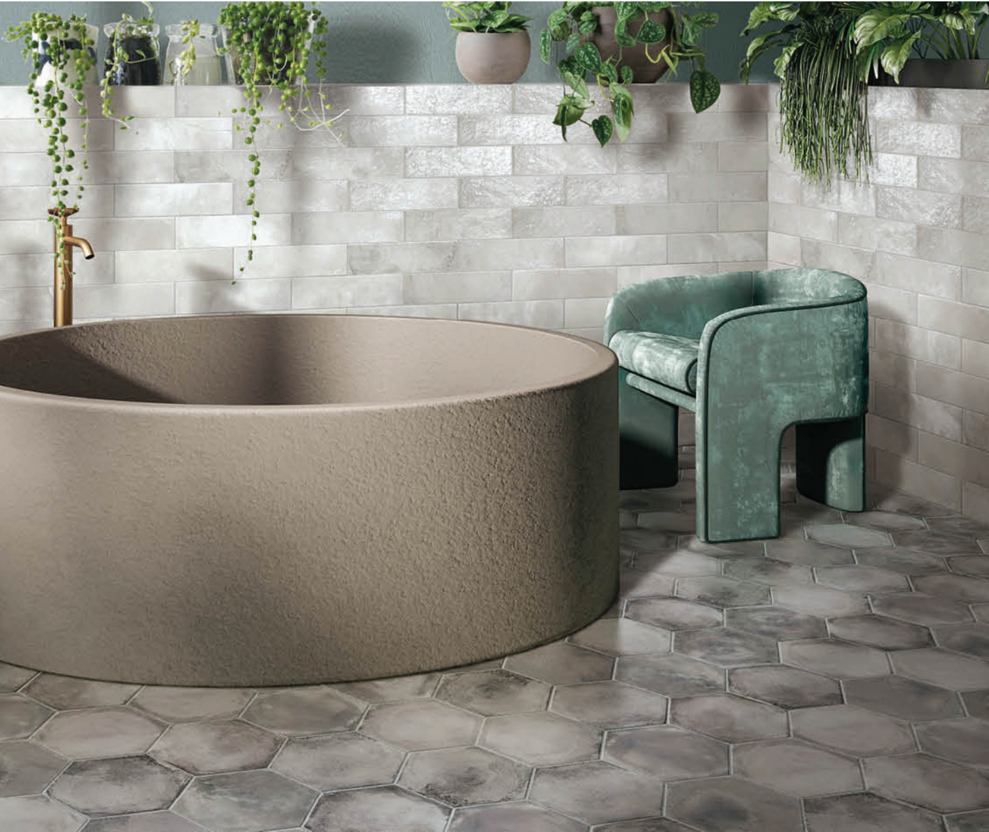
9.5" x 11" Hexagon in Perla | 4" x 16" Floor/Wall Tile in Bianco