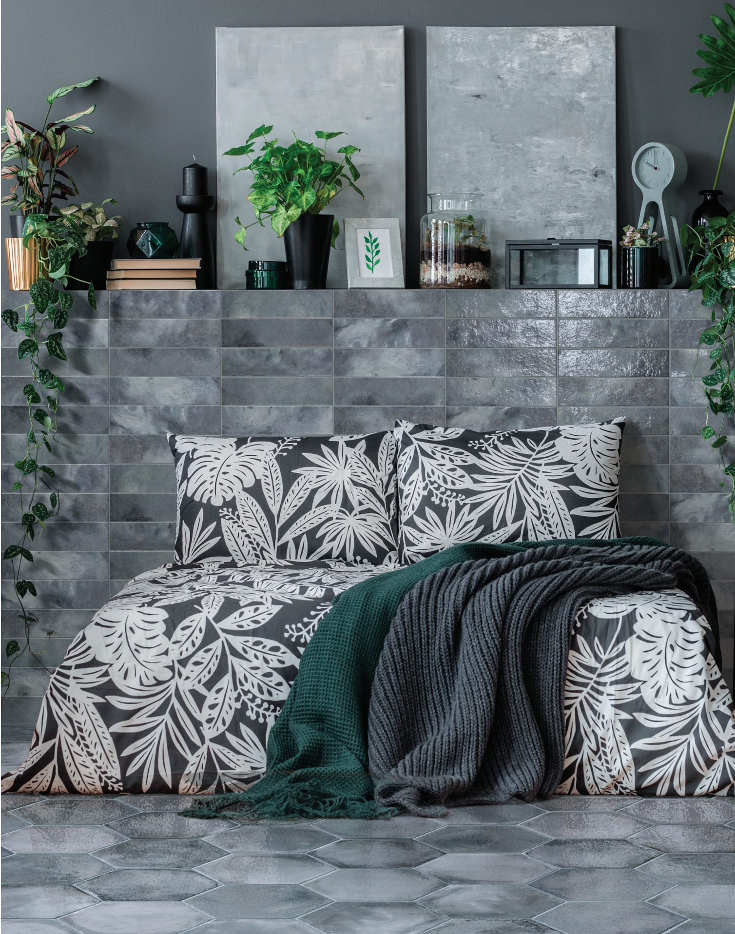
9.5 " x 11" Hexagon | 4" x 16" Floor/Wall Tile in Blu