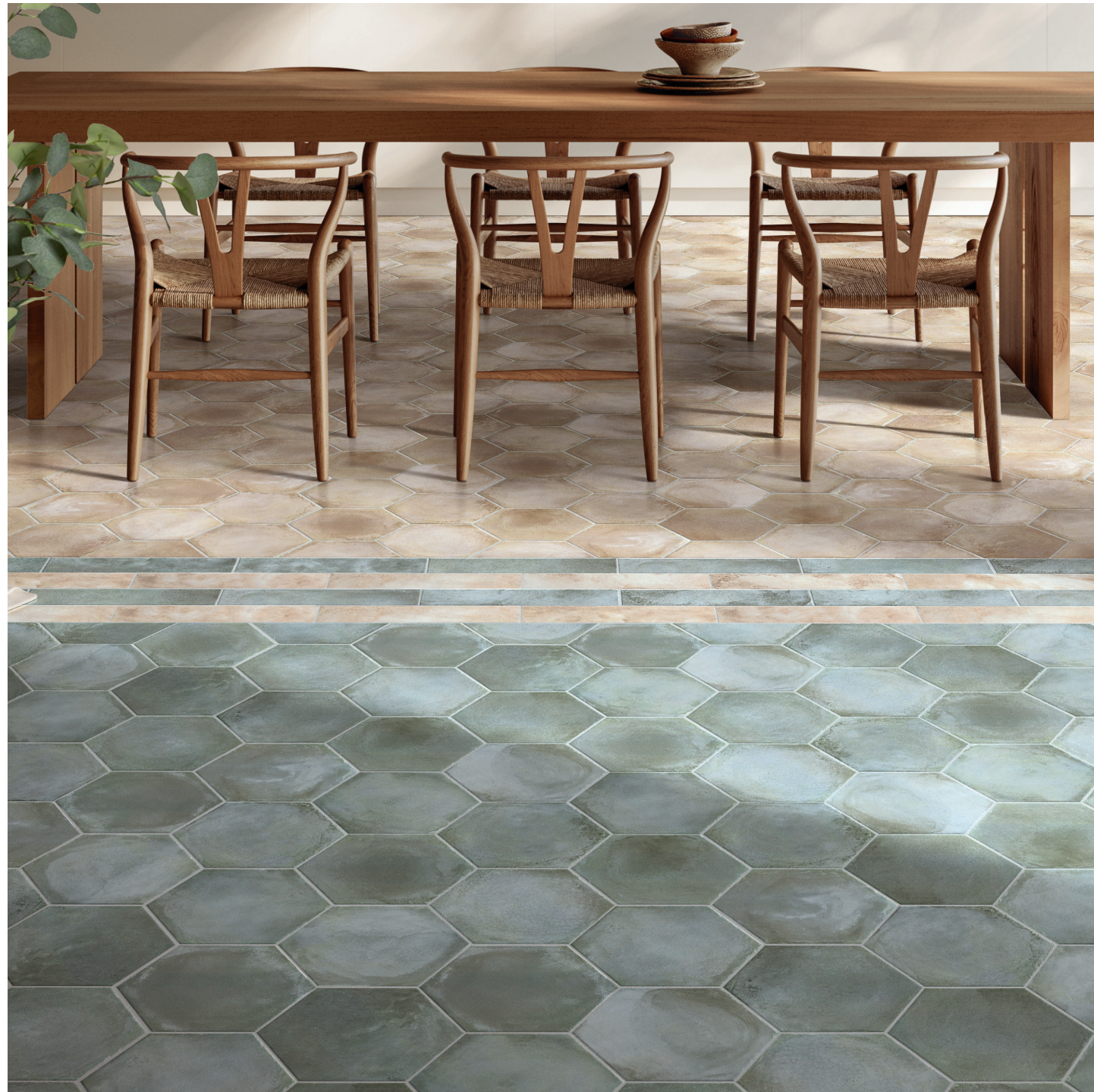
9.5 " x 11" Hexagon | 4" x 16" Floor/Wall Tile in Sabbia 9.5 " x 11" Hexagon | 4" x 16" Floor/Wall Tile in Verde