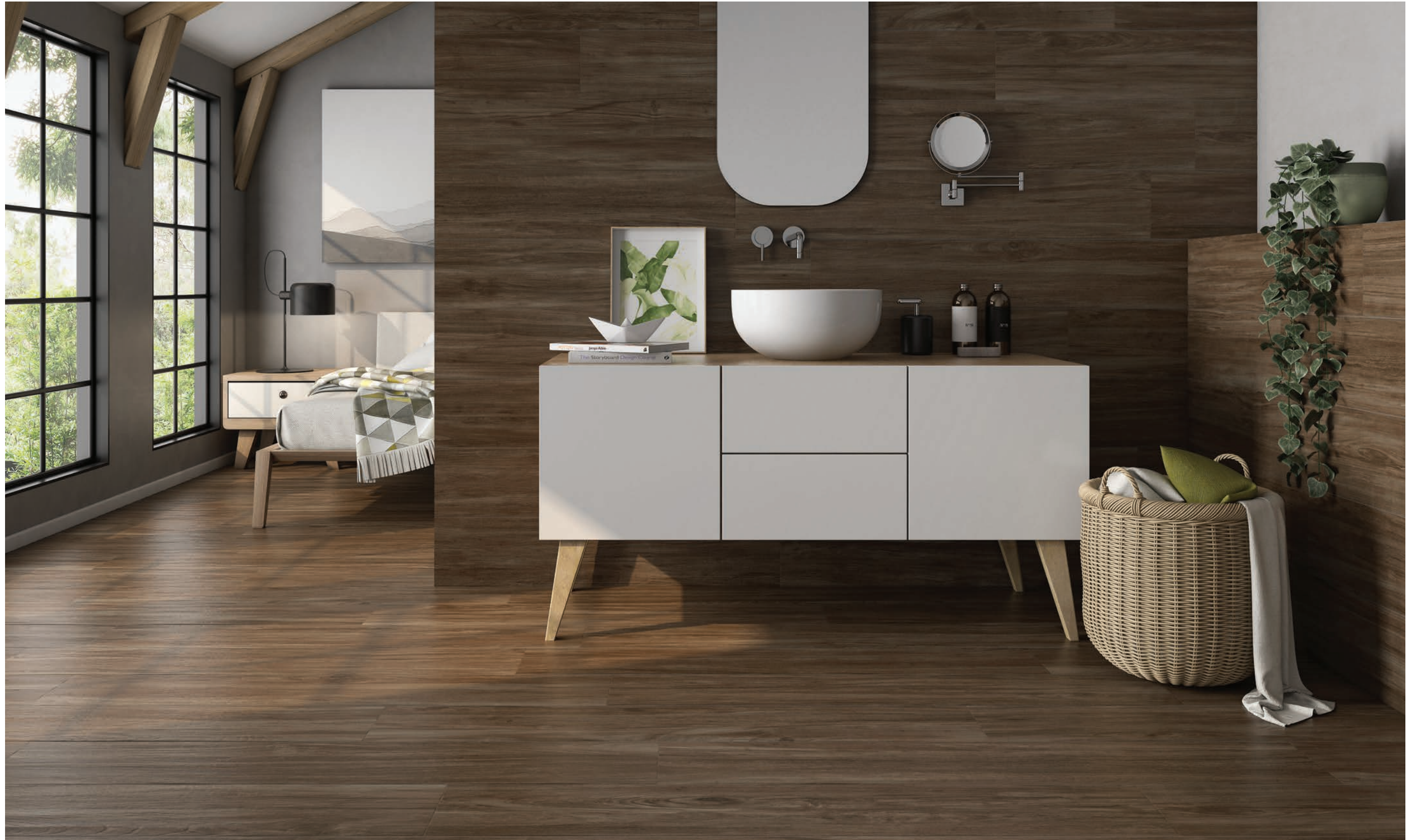
8"x48" Field Tile in Nut